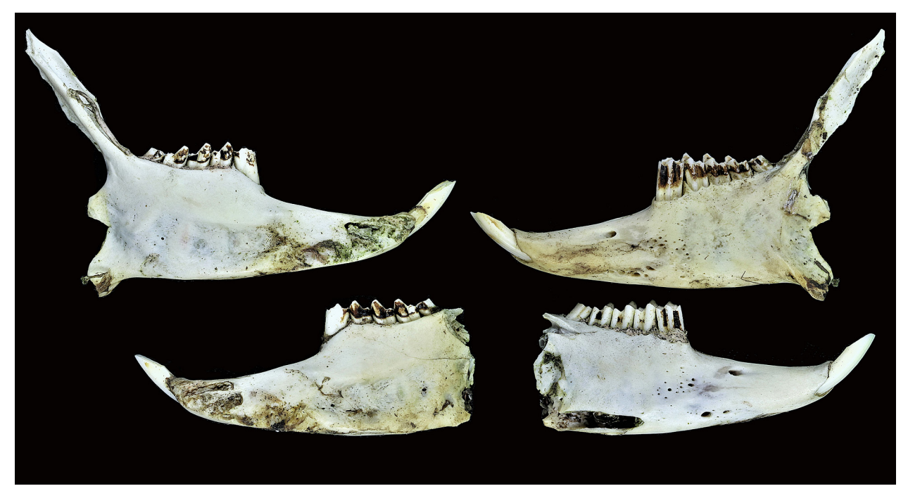
Figure 1. Lower jaw fragments of Lepus timidus (Linnaeus, 1758) from the Novaya Zemlya Archipelago.