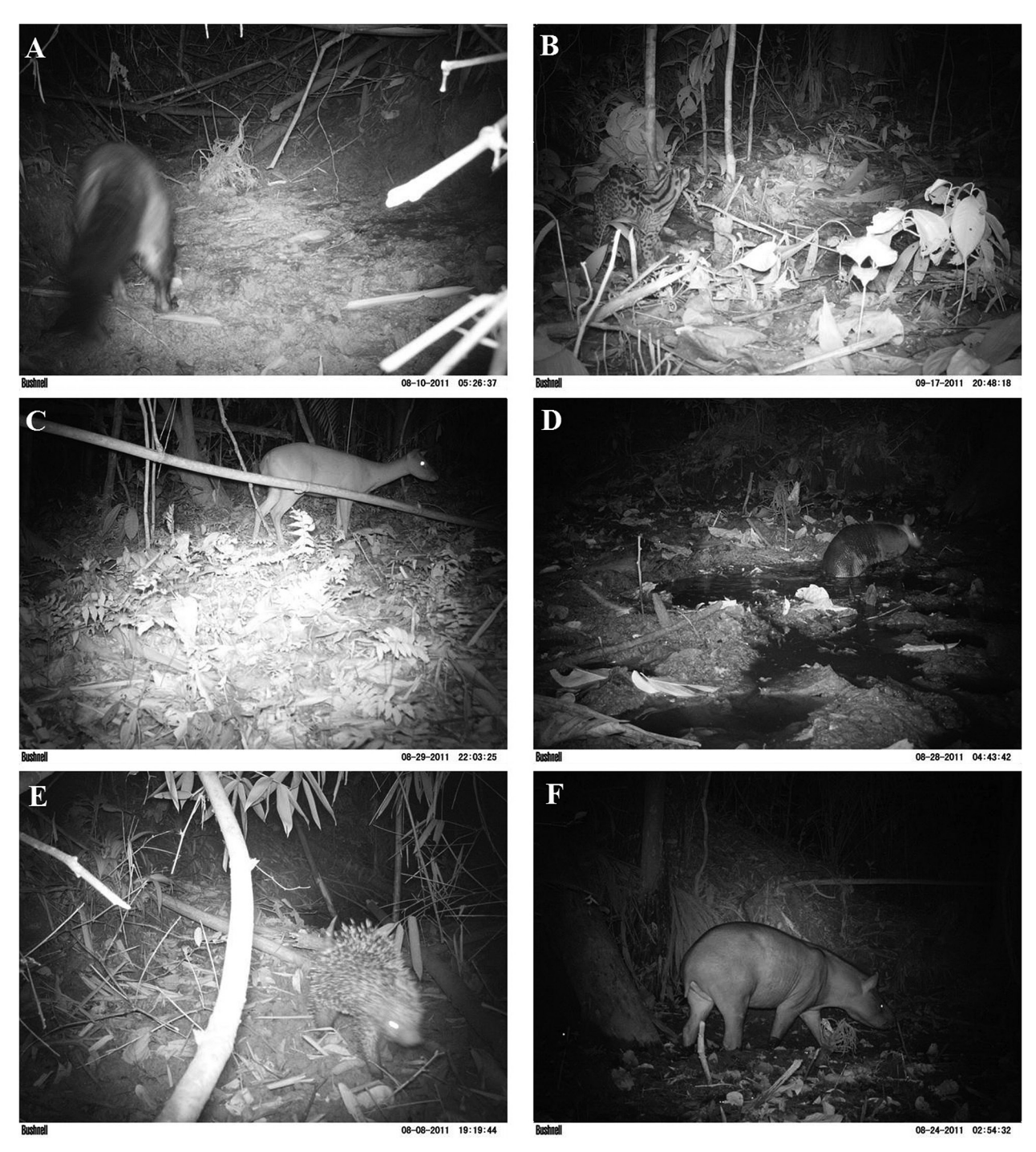
Figure 2. Mammalian species recorded in the Cazumbá-Iracema Extractivist Reserve by camera-trapping. A. Procyon cancrivorus. B. Leopardus paradalis. C. Mazama americana. D. Dasypus pastasae. E. Coendou prehensilis. F. Tapirus terrestris.