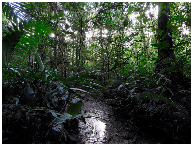
Figure 2. Forest with predominance of platanillos ( Heliconiaceae ), in which the first individual of Mimon cozumelae was captured in the core zone of the Río Plátano Biosphere Reserve, Wuarska, Colón.

Gardner (2008) for the taxonomy and nomenclature of the other taxa cited here.