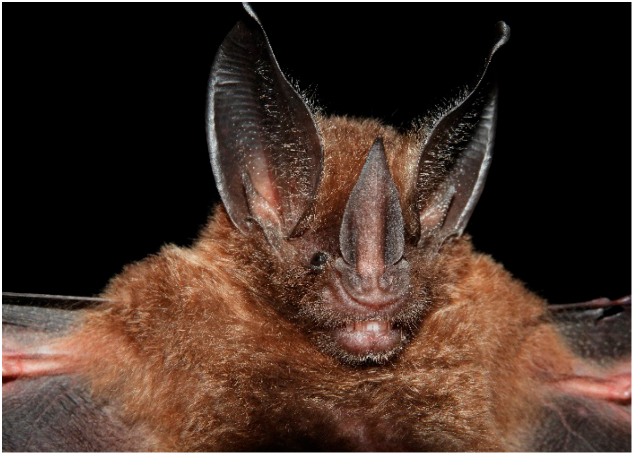
Figure 3. Live photograph of the adult male Mimon cozumelae (UVS-V-02059) collected at Wuarska, Colón.

Danny Ordoñez, Marcio Martínez leg., 1 adult male, UVS-V-02059 (Fig. 3) • Río Plátano Biosphere Reserve, El Limón; 15°22'39"N, 085°11'45"W; 310 m elev.; 18 Sept. 2018; Hefer Daniel Ávila-Palma, Danny Ordoñez, Marcio Martínez leg.; 1 adult male.