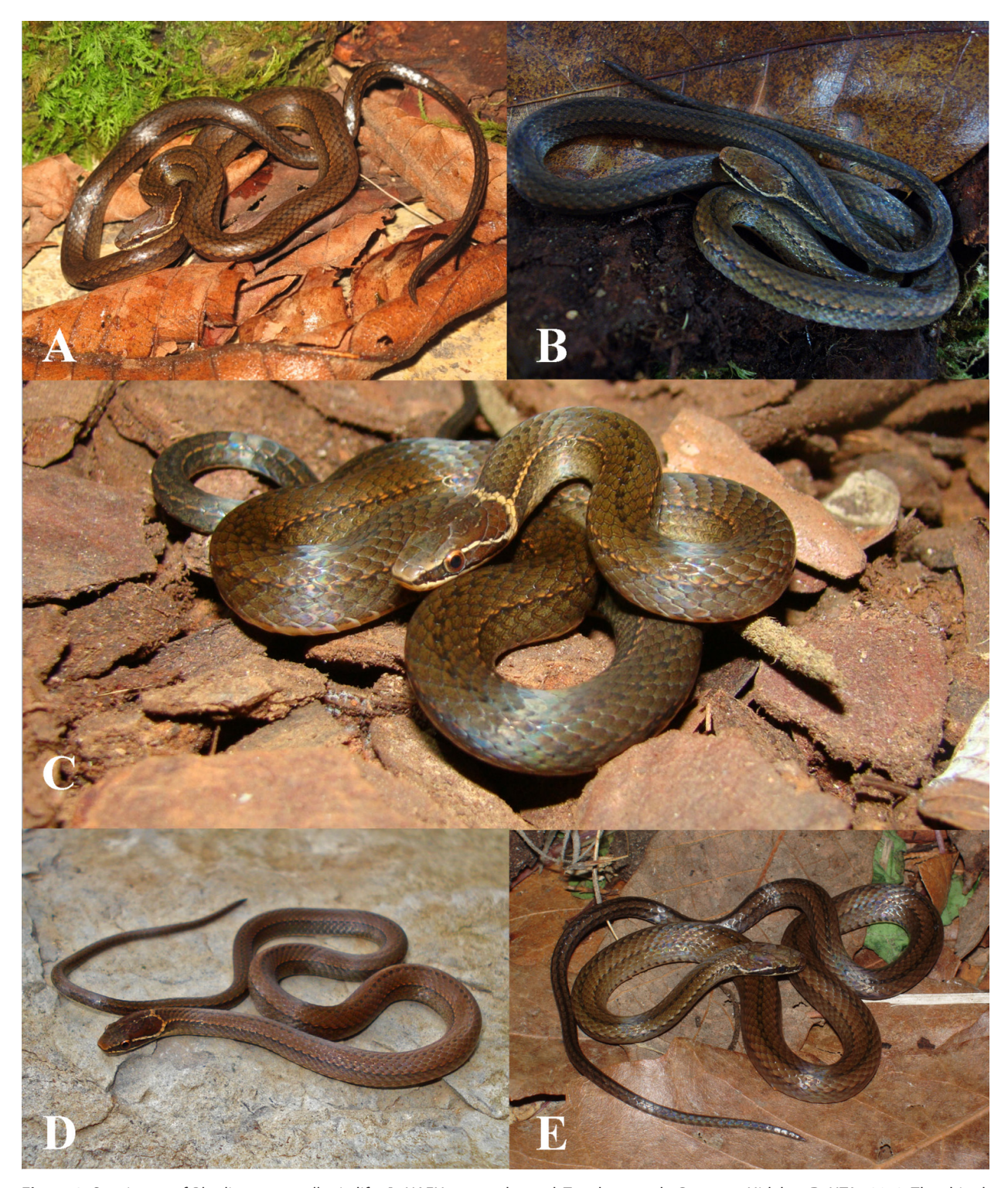
Figure 2. Specimens of Rhadinaea marcellae in life. A. UAEH unacatalogued; Tepehuacan de Guerrero, Hidalgo. B. UTA 53042; Tlanchinol, Hidalgo. C. MZFZ 3732; Chontla, Veracruz. D. MZFZ 3730; Xilitla, San Luis Potosí. E. MZFZ 3731; Hueyapan, Puebla.

separated from each other by induced grasslands, roads, and human settlements (Martínez et al. 2007, Nieto and Escandón 2010). It is necessary to increase collecting effort in these regions in order to verify the presence of R. marcellae . On the other hand, the locality of the Sierra de Otontepec has similar conditions to those of the nearest localities in the SMO, but it is isolated from these records by the coastal plain of the Golfo de México, a low elevation region (less than 300 m) with large areas of induced pasture and patches of secondary vegetation.