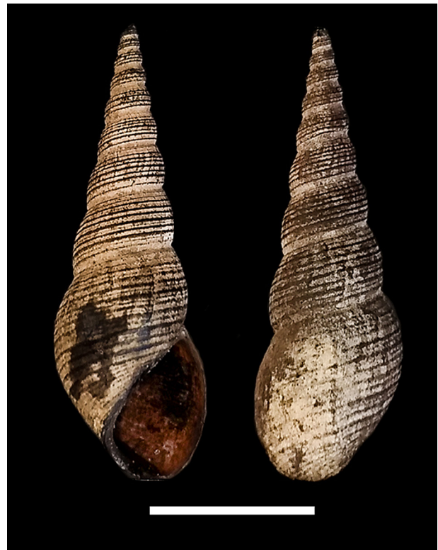
Figure 2. Melanoides tuberculata from water bodies of Território Vale do Guaribas, Piauí, Brazil (voucher number LBIFPI 01). Scale bar = 10mm.

The dispersion of M. tuberculata in the Território Vale do Guaribas might have been facilitated by anthropic actions, associated with trade in aquaculture products as observed in other states (Santos et al. 2012). The explanation for this means of dispersion is reinforced due to the absence of connection between the water bodies studied here. Besides that, there is no connection between the studied environments and those closer with previous records of M. tuberculata as the cities Parnaguá, Teresina (Piauí) and Orocó (Pernambuco), with 492, 260 and 270 km away from the Territory respectively.