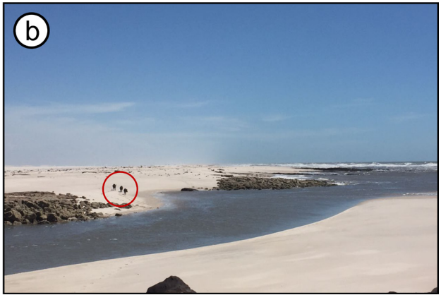
Figure 2. Wild Boar photographed in Lençóis Maranhenses National Park, Maranhão state, Brazil. A. One specimen photographed on July 2016 in a beach of the LMNP. B. Three individuals photographed on June 2017 crossing the Rio Preto (red circle), the only river that crosses the LMNP.