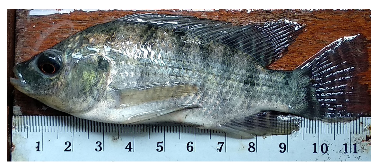
Figure 3. Oreochromis niloticus, Danau Kastoba on Bawean.

ranges. Environmental Biology of Fishes 96 (5): 603-616. https://doi.org/10.1007/s10641-012-0050-1