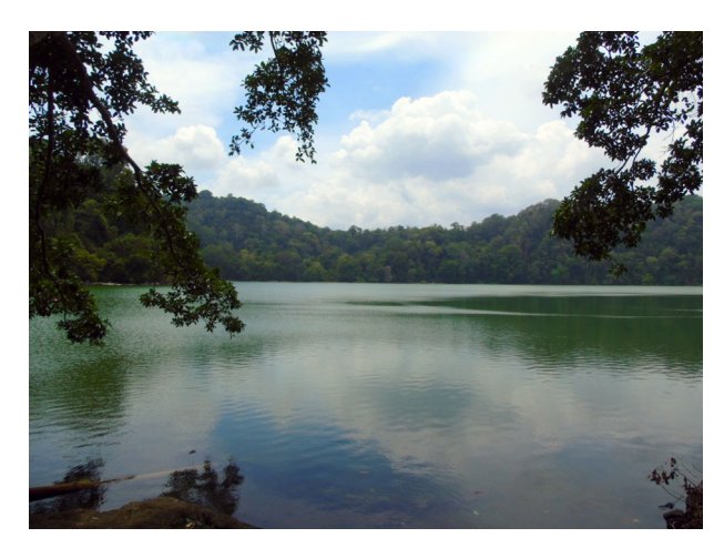
Figure 2. Danau Kastoba location where O. niloticus found in Bawean Island

Identification. Meristic and Morphometric characters of O. niloticus are given in Table 1. Other specific morphological characters are as follows: scales cycloid; gill rakers short; 3 rows of scales on cheek; maxilla and lower jaw equal; teeth widen; pectoral fin pointed; dorsal, pectoral and anal fins blunt; caudal scaly. Coloration: anal fin faintly barred; caudal and soft dorsal fin sharply barred; about 9 narrow dark bars on sides body; dark blotch at corner of operculum.