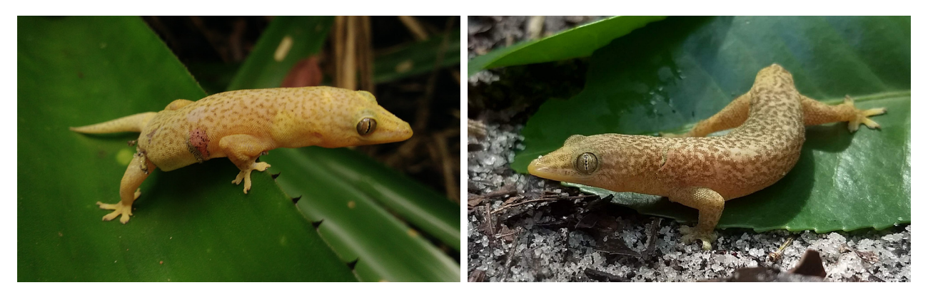
Figure 2. Specimens of Phyllopezus lutzae rescued during a fauna rescue program at municipality of Caaporã in Paraíba state, Brazil.