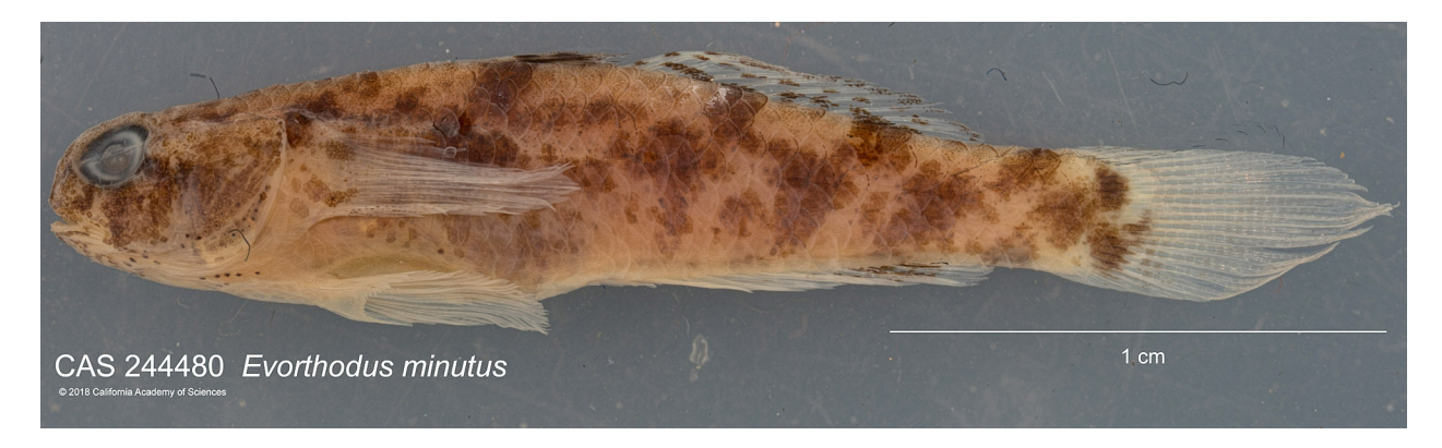
Figure 2. Evorthodus minutus collected in May 1932 from tidepools of Academia Bay, Santa Cruz Island, Galapagos.

Table 1. Morphometric characters of Evorthodus minutus, CAS 244480. All values except for total length (TL) and SL are proportions.