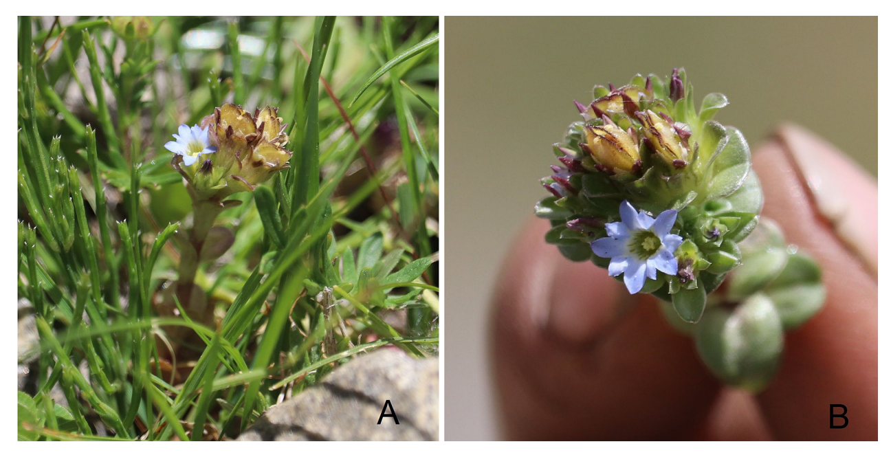
Figure 1. Gentiana capitata Buch.-Ham. ex D.Don subsp. harwanensis (G.Singh) Halda. A. Habit. B. Flower.

the herbaria of Kashmir University (KASH) where the holotype is deposited, National Botanical Research Institute, Lucknow (LWG), and from the image of the isotype deposited in the New York Botanical Garden (NY). The voucher specimens are deposited in LWG.