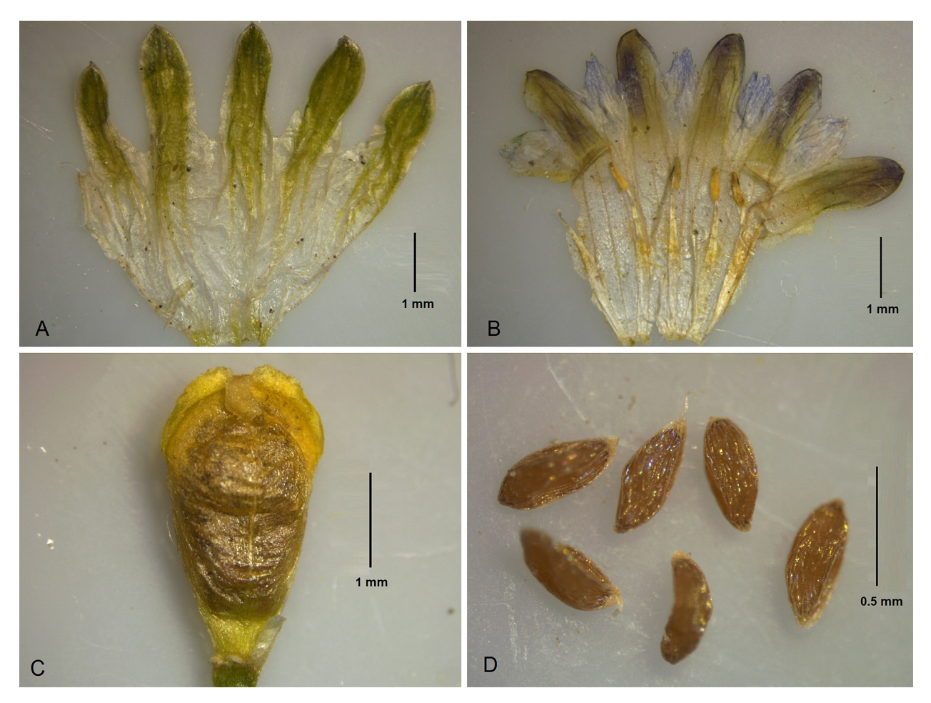
Figure 2. Gentiana capitata Buch.-Ham. ex D.Don subsp. harwanensis (G.Singh) Halda. A. Calyx. B. Corolla. C. Capsule. D. Seeds.

tographs made of the floral parts using a stereo-zoom microscope (Leica). Field photographs were taken by using a camera (Canon EOS D200). Figures were edited using software Adobe Photoshop.