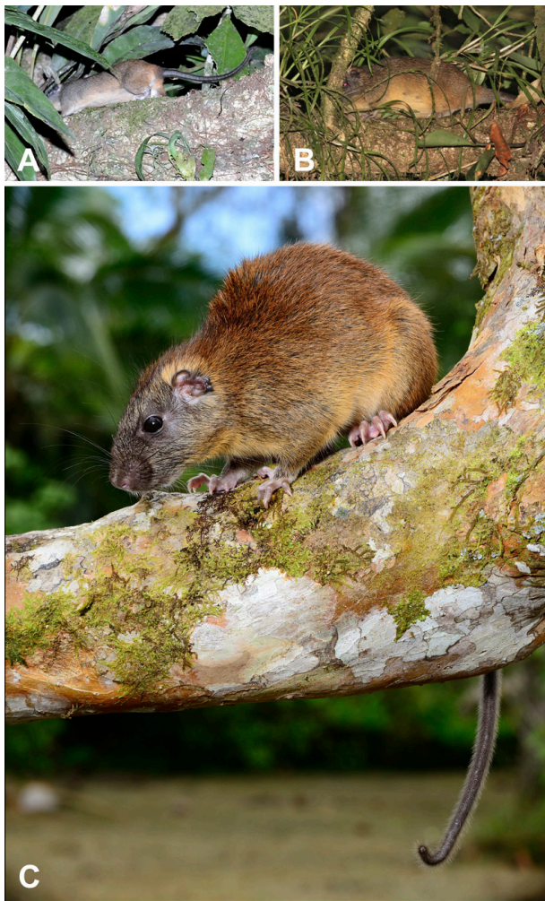
Figure 1. A, B. Two photographs of the same individual of Diplomys labilis observed in February 2016. C. A photograph of a second individual of D. labilis (ASNHC-18436) captured in January 2017, all from Bartola River, Río San Juan, Nicaragua.

adult female D. labilis (Fig. 1A, B) near the Bartola River. This small river constitutes the border between the Refugio Bartola Private Reserve and the Indio-Maíz Biosphere Reserve. We were about 1 km north of the mouth of the Río San Juan River, in the Río San Juan Department located in southern Nicaragua. The rat was actively moving on a branch of a Zotacaballo tree ( Zygia longifolia ) about 3 m above the water. After about 4 minutes of direct observation, it disappeared from sight into the canopy. The tree's total height was estimated at about 12 m, although the forest in the surrounding area has a significantly higher canopy (35–40 m). The general area corresponds to Lowland Wet Forest (Holdridge 1967) with abundant arboreal vegetation and epiphytes.