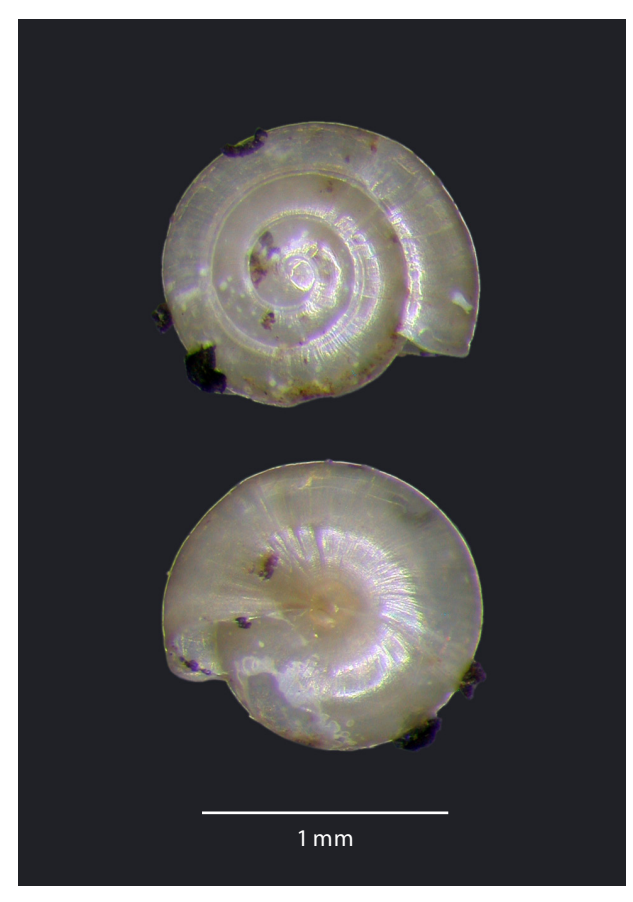
Figure 2. Guppya sterkii , woodlot on 9th Line Road, ca 2.6 km SSE of intersection with Victoria Road, near Metcalf, Ottawa, Ontario (NBM 010007, largest specimen).

Species of snails were identified using the monograph of Pilsbry (1939–1948); G. sterkii appears in volume II, part 2 of Pilsbry's (1946) monograph. Whorls were counted, to the nearest ½ whorl, by the method of Kerney