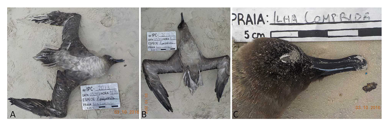
Figure 3. Phoebetria palpebrata, municipality of Ilha Comprida, state of São Paulo, Brazil. A. Dorsal view. B. Ventral view. C. Head, with the characteristic blue sulcus along the lower mandible.

Phoebetria palpebrata. The specimen had a distinctive frosty-gray mantle extending from neck to lower back and rump, contrasting with a dark brown head and wings (Fig. 3). The specimen also had a blue sulcus along the lower mandible (Fig. 3), which is cited by Harrison (1983) and Lima et al. (2004) as a distinctive character. The morphometries were as follows: total length 970.0 mm; head length 187.0 mm; exposed culmen 106.0 mm; wing chord 509.0 mm; tail 255.0 mm; tarsus 80.0 mm; middle toe with claw 124.0 mm; middle toe without claw 110.0 mm.