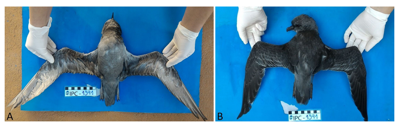
Figure 2. Lugensa brevirostris, municipality of Ilha Comprida, state of São Paulo, Brazil. A. Ventral view. B. Dorsal view.