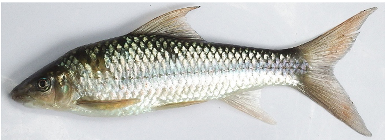
Figure 2. Specimen of Lobocheilos ixocheilos caught on 19 April 2016 from the Musi basin, Muara Kulam River, South Sumatra (Photograph by M. Iqbal).

The distance between Muara Kulam River of Musi basin with previous localities where L. ixocheilos previously found in Sumatra is about 150 and 250 km. Major studies of cyprinid faunas in Southeast Asia have occasionally been confined to single drainage basins (Rainboth 2001). For the example, in Sumatra, a fish fauna survey in Batang Hari basin conducted by Tan and Kottelat (2008) has given better understanding on cyprinid fish diversity in this area, compare to other basins in the island. For a