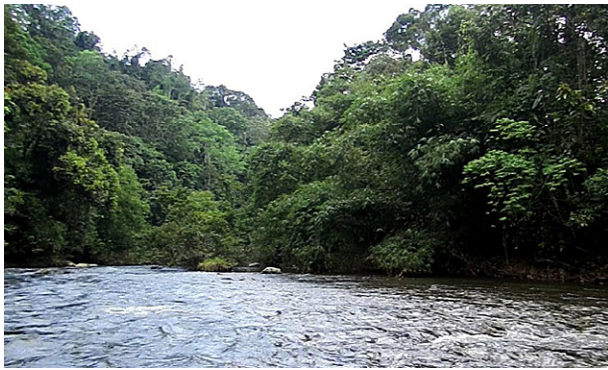
Figure 1. Muara Kulam River of Musi basin, location where L. ixocheilos found in South Sumatra province.

carried out on 19–22 April 2016 in the Muara Kulam River (02°48'10.6" S, 102°21'11.2" E), a tributary of the Lematang drainage in the Musi basin. This river is surrounded by secondary dipterocarp forest with little encroachment and a low intensity of selective illegal logging by local people (Fig. 1). Administratively, the site is located in Muara Kulam village, Rawas Ulu subdistrict, Musi Rawas district, South Sumatra province. The topography is hilly forested at 508 m above sea level. This area is under the management of subsection V or SPTN V (SPTN = Seksi Pengelolaan Taman Nasional Wilayah, or or Regional Park Management Section) of Kerinci Seblat National Park (Anonymous 2016). Due to the area being part of a national park, collection of specimens is prohibited, unless special permits are obtained. Unfortunately, as we did not have a permit for collecting specimens during our fieldwork, no voucher specimens were retained.