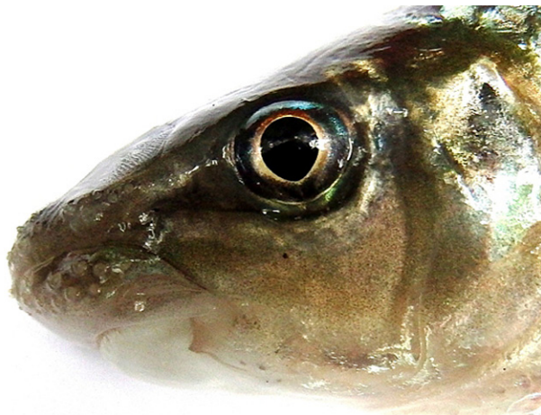
Figure 3. Close view of head of Lobocheilos ixocheilos showing the mouth pattern.