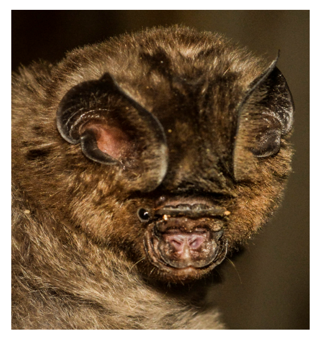
Figure 1. Adult female, Hipposideros galeritus , Cantor's Leaf-nosed Bat, Hipposideros galeritus from Ukkarahalli, Kolar district, Karnat-aka, India.

matic breadth (ZB), braincase breadth (BB), maxillary toothrow (C–M<sup>3</sup>), posterior palatal breadth (M<sup>3</sup>–M<sup>3</sup>), anterior palatal breadth (C<sup>1</sup>–C<sup>1</sup>), mandible length (M), and mandibular toothrow (C–M<sub>3</sub>). Measurements were taken using a digital vernier calliper (Mitutoyo Co.). The voucher specimens (Voucher numbers provided in Table 1) were deposited in the collection of the Natural History Museum of Osmania University, Hyderabad, Telangana State.