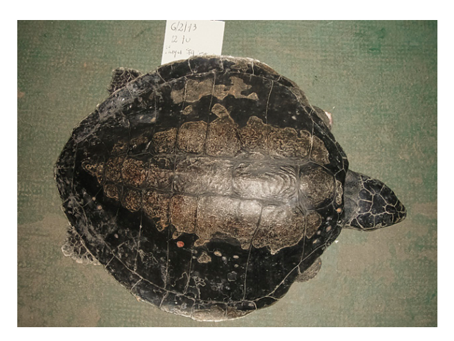
Figure 3. Record 6, a live Lepidochelys olivacea found on the beach at El Barco, Santa Teresa National Park, Rocha, Uruguay.

Stranding records included: a bycatch in which the turtle was entangled in an artisanal coastal gill net causing its death (record 4); a rescue alert in which the turtle was found alive (record 6) with the frontal flippers amputated (Fig. 3); and a stranded dead turtle (record 7). Record 6 is the southernmost stranding record of an alive L. olivacea in the western Atlantic Ocean to date. The turtle was transferred immediately to the Karumbé Rescue Center for first aid and veterinarian assistance, but after 6 months of treatments, it died due to multiorgan failure (Table 1, Fig. 1).