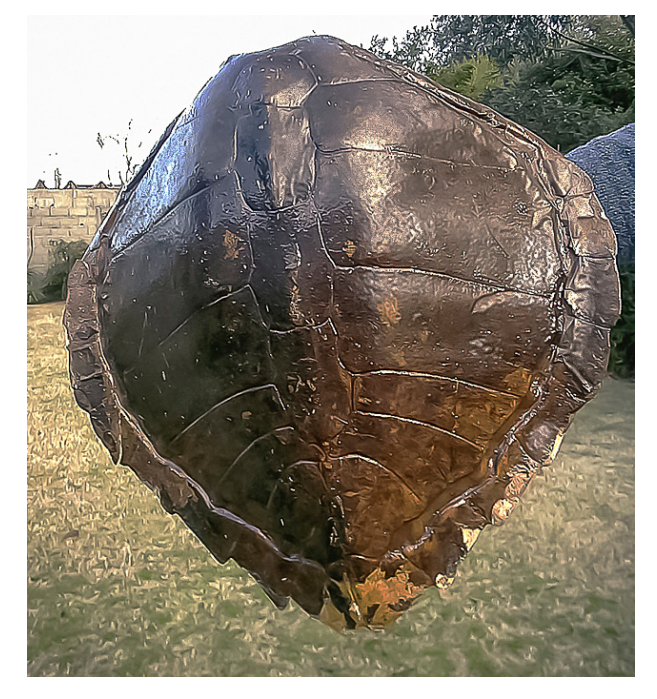
Figure 2. Record 1, a carapace of Lepidochelys olivacea found in a restaurant in La Coronilla, Rocha, Uruguay.