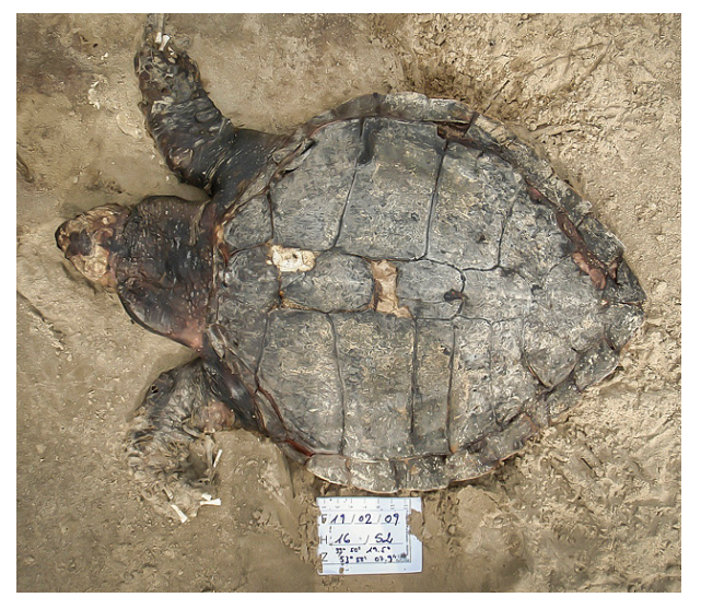
Figure 4. Record 5, a stranded, dead, Lepidochelys olivacea at Palmares de la Coronilla, Rocha, Uruguay.

Records 5 (Fig. 4) and 8 were registered as stranded dead turtles through beach surveys (Table 1, Fig. 1).