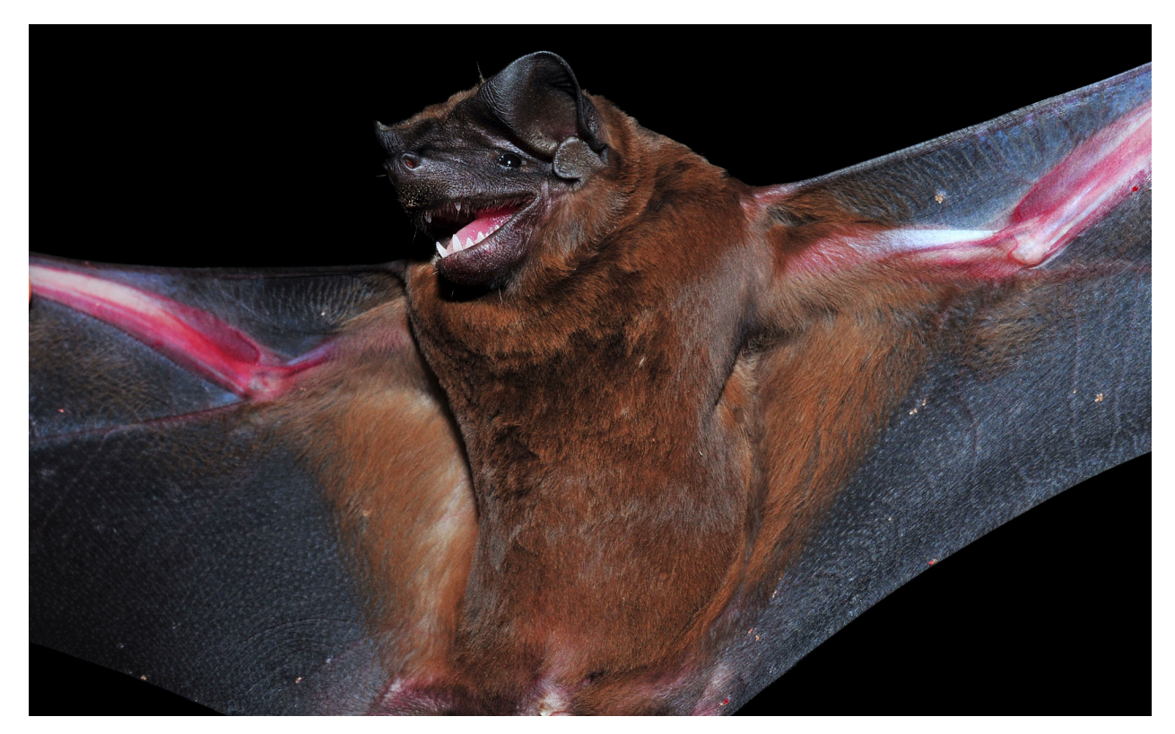
Figure 1. Female of Molossus pretiosus (CMARF 0992) from São Félix do Coribe, Bahia, Brazil.

One neither pregnant (by palpation) nor lactating adult female of Molossus pretiosus was captured in the elevated mist-net. Many bats were seen foraging above the net at approximately 10 m height, and the single capture occurred 10 min. after sunset at 18.00h, when the individual of M. pretiosus dived on flight to capture an insect and could not avoid the net.