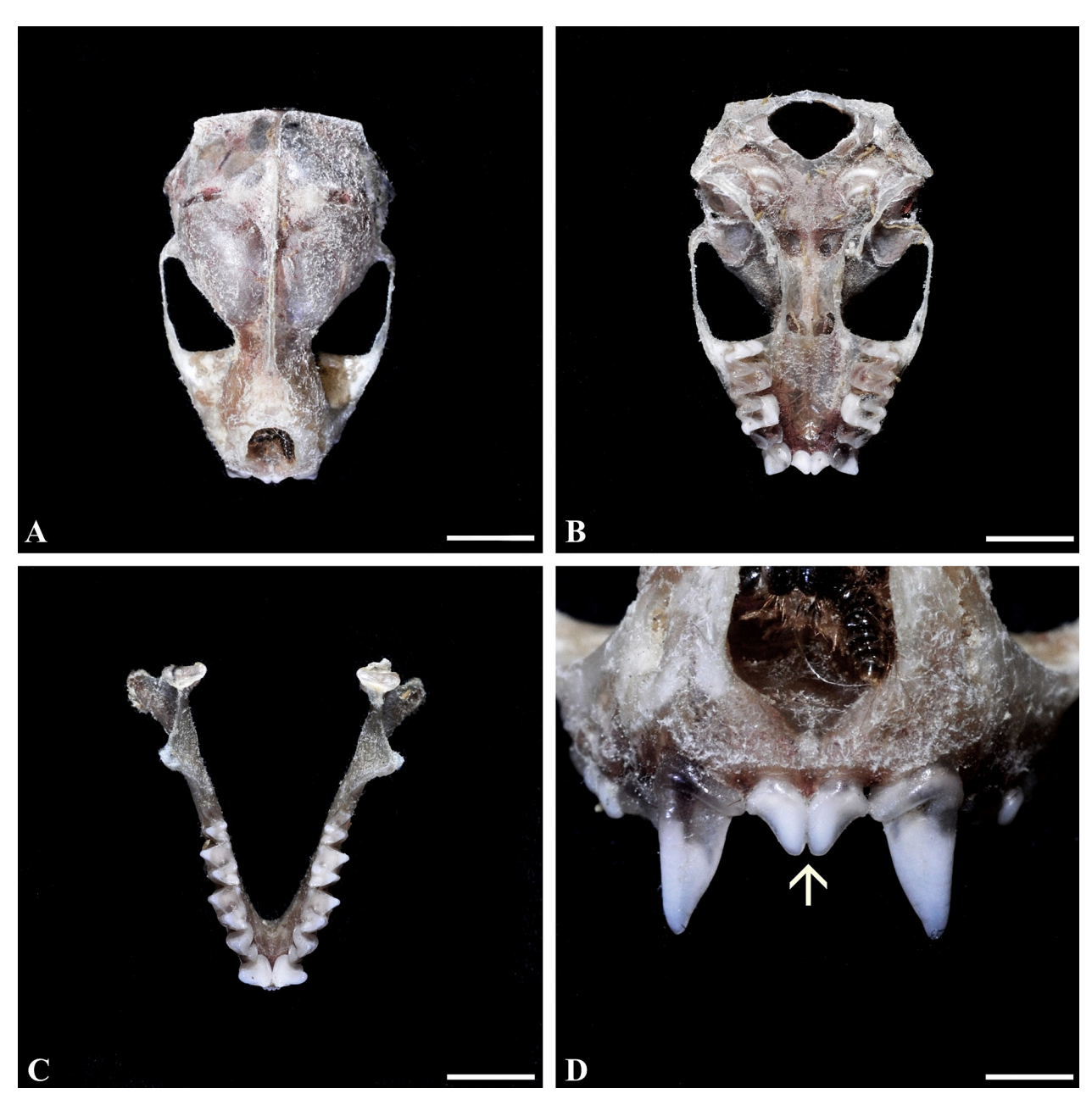
Figure 2. Skull and mandible of Molossus pretiosus (CMARF 0992). A and B: dorsal and ventral views of skull (scale bar: 5 mm); C: mandible (scale bar: 4 mm); D: upper incisors with separated tips (scale bar: 1 mm).

Identification. The specimen presented general reddish coloration, face and membranes dark although not entirely black; fur on uropatagium reaching the proximal third; and dense ventral pelage on the wings at the region close to the body and forearm (Fig. 1). Dorsal furis darker than ventral, short (3.5 mm) and weakly bicolor with a reddish brown basal band (ca. 60% of fur length) and tips slightly darker. Ventral fur is also bicolored, short (3 mm), with a light brown basal band and reddish-brown tips, sprinkled with whitish hairs (Fig. 1). Dense fur on the base of the ears reaches 1/3 of its breadth, and the antitragus is oval with a constriction on the basis. There are long hairs on the feet (5 mm) and a few hairs longer than the fur over the dorsal posterior region of the body (16 mm). Skull is short and broad, with a well-developed sagittal crest and bulge braincase. The upper incisors are long and with separate tips; and the M3 has a V-shaped cusp pattern