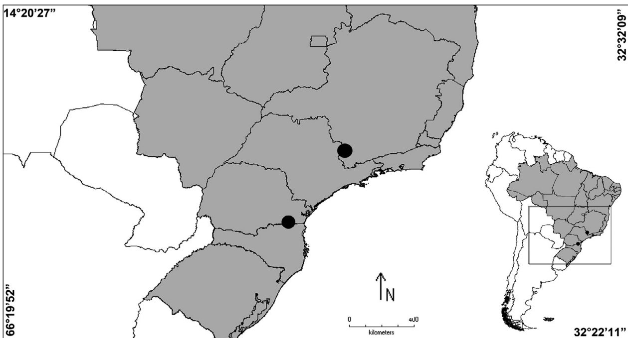
Figure 20. Occurrence map of the distribution of Pseudephemerum nitidum in Brazil.