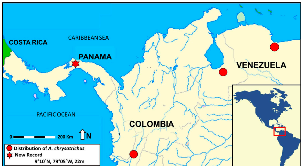
Figure 2. Map showing the known distribution of the Aulacophilus chrysotrichus Antropov, 1999, including first record from Panama.

body, the largely pale coloration of the mandibles and humeri, the mesopleura with more than 12 longitudinal carinae below scrobe, the postscutellum without coarse longitudinal carinae, the pronotal ridge without posterior median depression, the propodeum with a short preapical depression, and the non-outlined dorsal field (Antropov