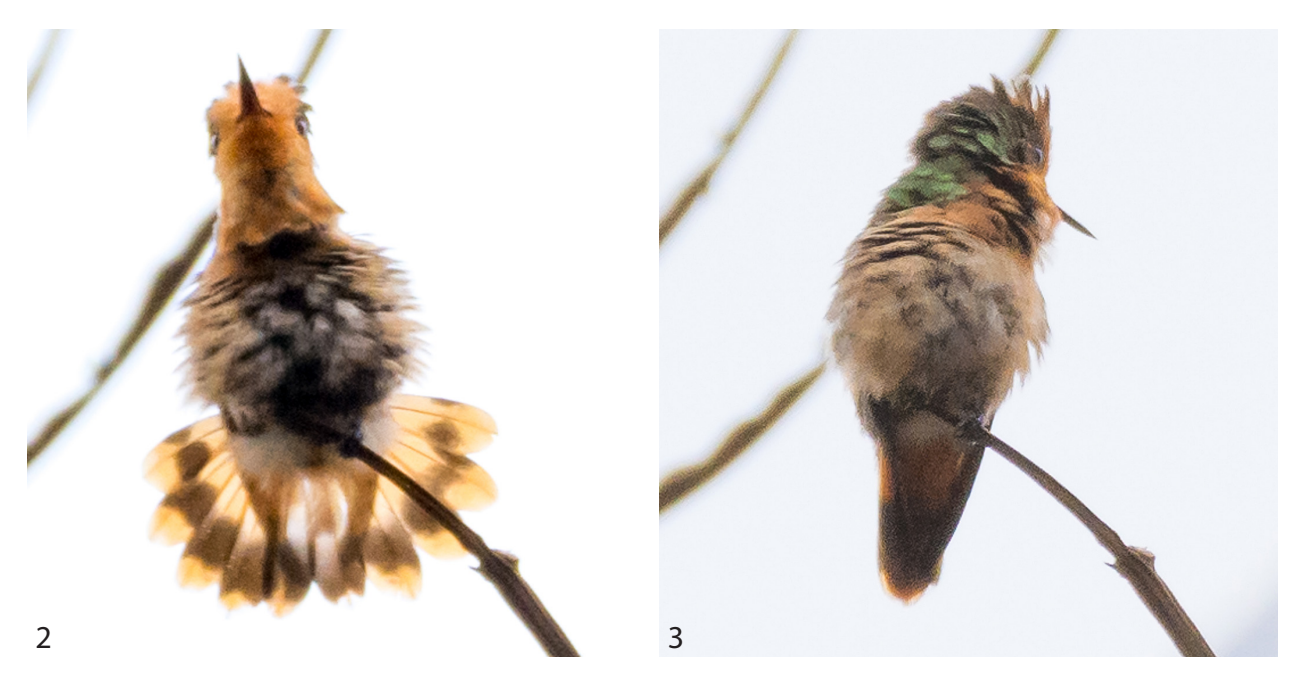
Figures 2, 3. Cf. Rufous-crested Coquette, Lophornis cf. delattrei . Note the orange forehead and the tail with blackish subterminal bar.

on a fine branch of an Inga sp. tree. The hummingbird remained on this perch for approximately 5 minutes, allowing it to be photographed (Figs. 2, 3).