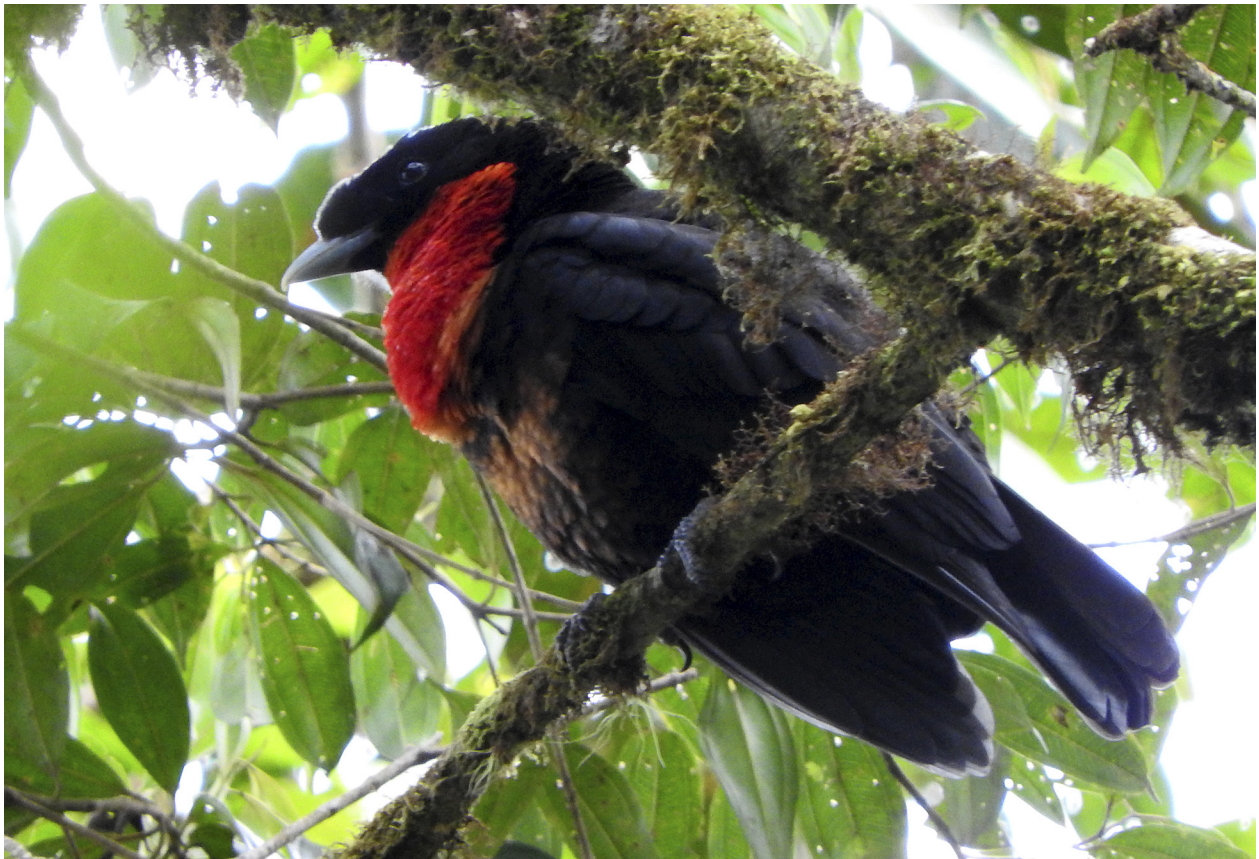
Figure 2. Photograph of Red-ruffed Fruitcrow Pyroderus scutatus masoni taken in the Cordillera del Cóndor region of Ecuador, with details of the head, throat, chest and belly.