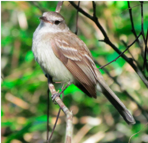
Figure 2. Individual of the Mouse-colored Tyrannulet, Phaeomyias murina , photographed on 12 December 2013 in the municipality of Dezesseis de Novembro, northwestern Rio Grande do Sul, Brazil.

the record site. Even though habitat characteristics are apparently appropriate for the species in the area, it is not possible to affirm that P. murina is regular there, considering that the area was sampled other 3 times along 2013, when the species was not detected.