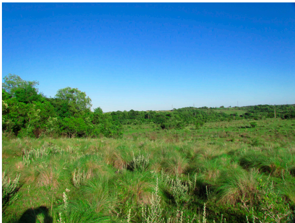
Figure 3. Habitat occupied by the Mouse-colored Tyrannulet, Phaeomyias murina, at Dezesseis de Novembro, northwestern Rio Grande do Sul, Brazil.