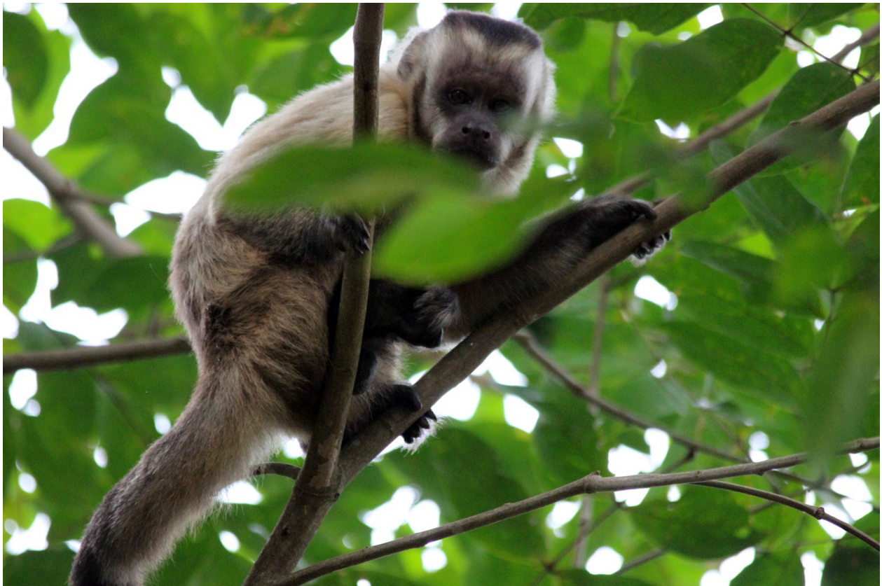
Figure 2. Young Sapajus cay observed at site 2.

the Sararé and Irantxe/Manoki reserves. Even though capuchins are one of the primary targets of indigenous hunters in these areas, these human settlements may still play an important role in the conservation of the region's primates, and the rest of its biota, in the long term.