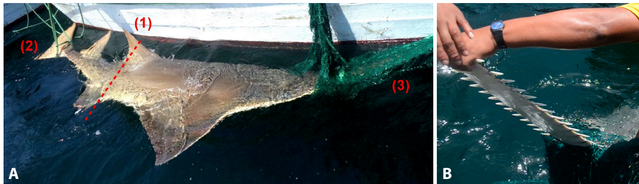
Figure 3. Sawfish captured on 14 February 2015, taken alive to Cancas, Tumbes and later released. A. Entire specimen showing (1) dorsal fin anterior to the origin of the pelvic fins, (2) the caudal fin, and (3) the rostrum. B. Another view of the rostrum.

specifying them. The other publication is a revised list of Chondrichthyans in Peru (Cornejo et al. 2015), which included P. pristis and P. pectinata . Given that the inclusion of this species in PRODUCE (2014) and Cornejo et al. (2015) are the result of literature reviews and are not based on field surveys, the documentation here of 2 new specimens provide the first empirical records of P. pristis in Peru since 1999.