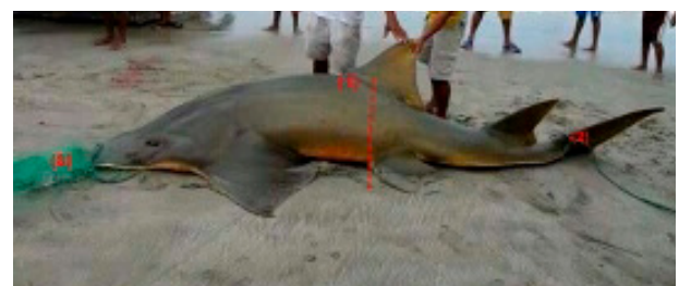
Figure 2. Sawfish landed dead at La Cruz, Tumbes, on 22 January 2014.

In Peru, the last year that sawfishes were observed was 1999 (Carlos Inga pers. comm.). Since then, a couple of publications reported the presence of sawfishes in Peru based on Chirichigno and Cornejo (2001). The National Action Plan for the Conservation and Management of Sharks, Rays and Related Species in Peru (PRODUCE 2014) mentions 2 species of Pristidae but without