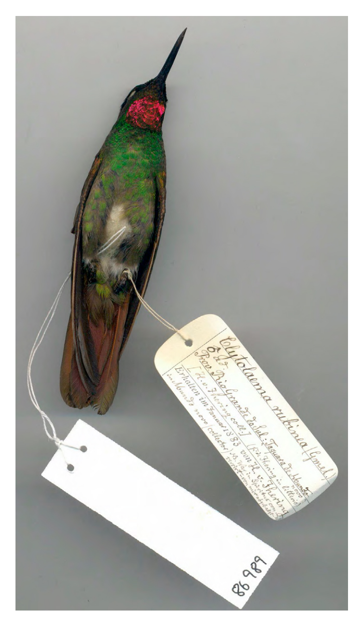
Figure 1. Specimen of Heliodoxa rubricauda from the Senckenberg Museum, Frankfurt, collected by Hermann von Ihering at Taquara, Rio Grande do Sul, southern Brazil, in the early 1880s.

coherence, since woodlands around Porto Alegre are relatively poor in Atlantic Forest endemics compared to forests on the adjacent escarpment (e.g., at Taquara).