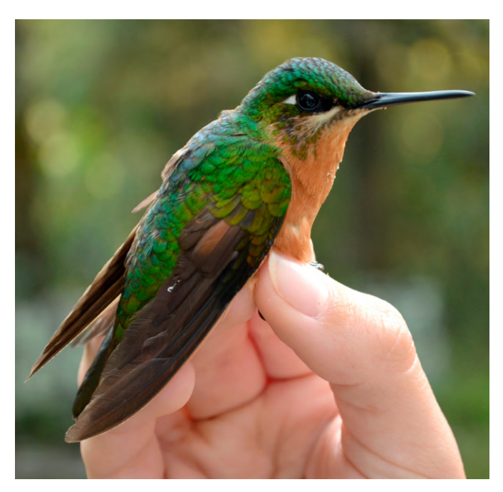
Figure 8. Female Heliodoxa rubricauda captured on 16 October 2016 at Cambará do Sul, Rio Grande do Sul. The extensively cinnamon underparts are diagnostic in range.

In Rio Grande do Sul, a number of bird taxa are clearly associated with the humid forests of this narrow elevation zone along the seaward border of the Southern Brazilian Plateau. These include the Atlantic Forest race of the Spectacled Owl, Pulsatrix perspicillata pulsatrix ; the southern race of the Pale-browed Treehunter, Cichlocolaptes leucophrus holti ; the Black-capped Piprites, Piprites pileata ; the Swallow-tailed Cotinga, Phibalura flavirostris ; the Serra do Mar Tyrannulet, Phylloscartes difficilis ; and, to a lesser extent, the Barethroated Bellbird, Procnias nudicollis , and the Bay-chested Warbling-Finch, Poospiza thoracica (Bencke et al. 2003). Heliodoxa rubricauda may present a similar distribution pattern in the southern reaches of its range.