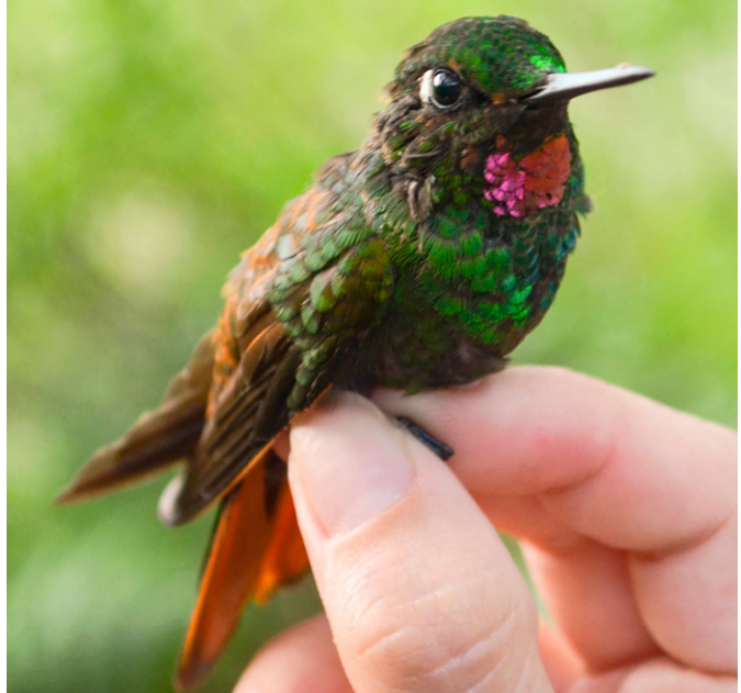
Figure 7. Male Heliodoxa rubricauda captured on 11 January 2016 at Cambará do Sul, Rio Grande do Sul. Note same distinctive features as in figures 4 and 6.

since at least 2 other hummingbird species are believed to be expanding their ranges in southern Brazil and into Rio Grande do Sul in recent years (STRAUBE et al. 2006, DAMIANI 2009, PETERSEN & PETRY 2009).