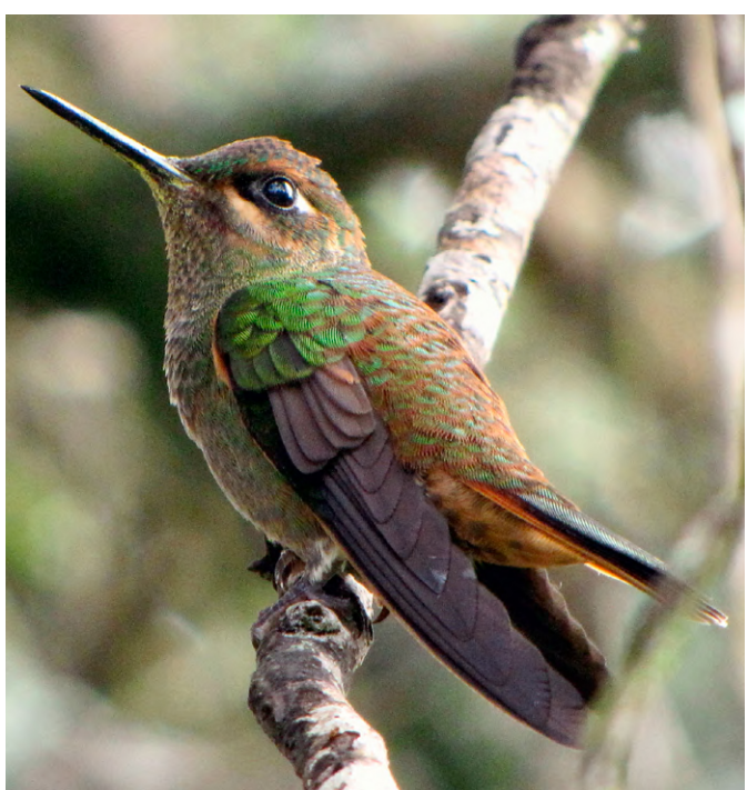
Figure 5. Immature Heliodoxa rubricauda photographed on 16 December 2010 at São Francisco de Paula, Rio Grande do Sul. Tail pattern and color of underwing coverts (not apparent in this photograph), in combination with the straight bill and overall body size, were useful to identify this individual.