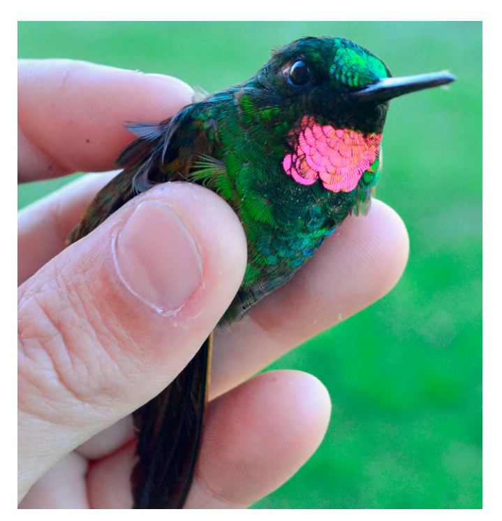
Figure 4. Male Heliodoxa rubricauda captured at CPCN Pró-Mata, São Francisco de Paula, Rio Grande do Sul, on 16 November 2014. The glittering red or pink gorget, in combination with the green underparts, is diagnostic in range.