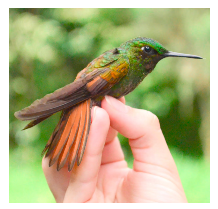
Figure 6. Male Heliodoxa rubricauda captured and banded on 11 January 2016 at Cambará do Sul, Rio Grande do Sul. Note diagnostic tail pattern.