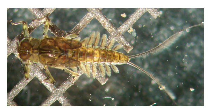
Figure 1. Dorsal habitus of Acentrella nadineae.

Acentrella nadineae has previously been reported from the US states of Kentucky, North Carolina, Ohio, Oklahoma, Pennsylvania, Tennessee, Virginia, and West Virginia (Fig. 3; previous records lack geocoordinates and are frequently imprecise,