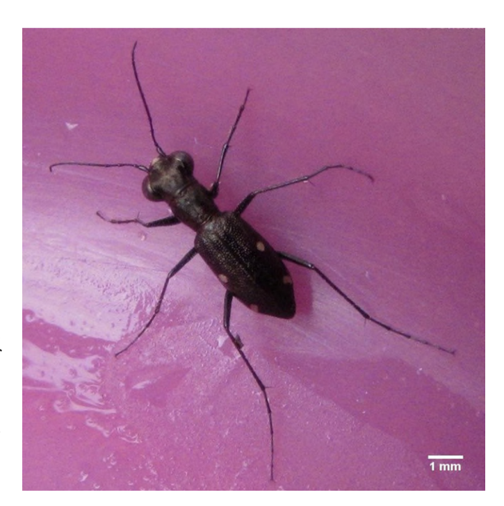
Figure 1. Male of Cylindera (Oligoma) paradoxa before preserving.

As part of an ongoing study on the distribution of tiger beetles in Sri Lanka, field expeditions were conducted to Ratnapura District, Sabaragamuwa Province in 2015. Collections were made under permit WL/3/2/72/14 from the Department of Wildlife and Conservation.