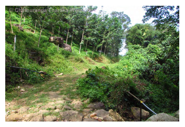
Figure 2. General view of the habitat from which the specimen was collected.

(1989). Body measurements of our specimen and other available specimens (DANGALLE at al. 2012; A. Matalin, personal communication) are listed in Table 2.