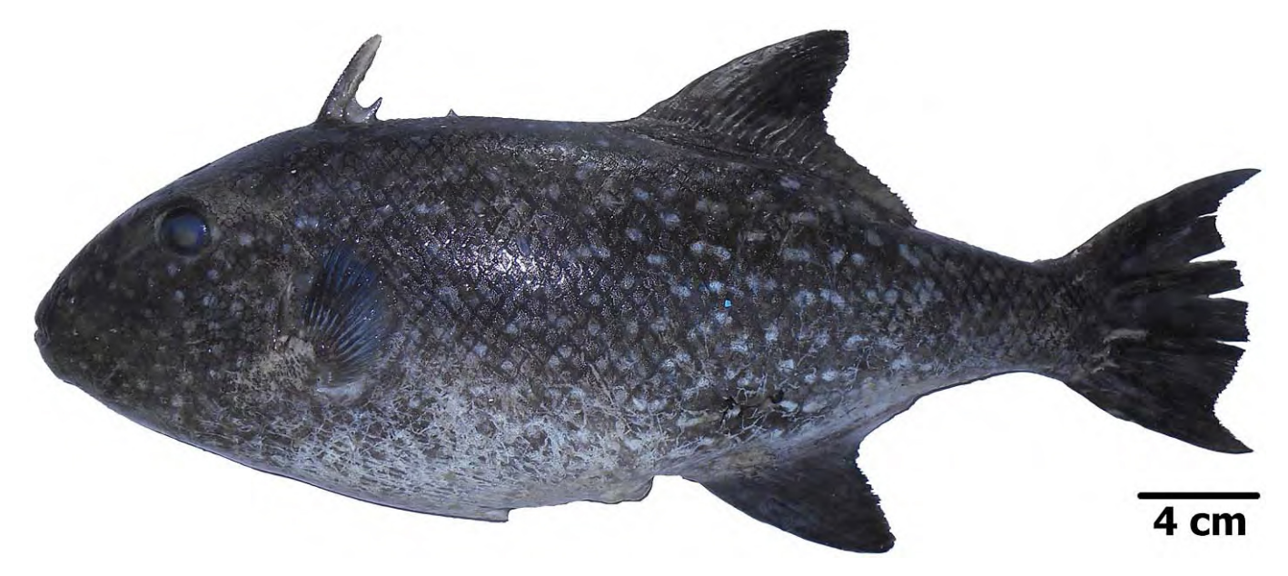
Figure 3. Canthidermis maculata , 400 mm, LABIPE 1101.

tic scheme proposed by COLLETTE & RUSSO (1981). The main morphometric and meristic data (Table 1) observed agree with the description reported by these authors. On 19 May 2016, 2 specimens of C. maculata (Fig. 3) were caught on the surface by an artisanal fishing boat with dip nets, at Urca da Conceição (04°55′ S, 036°05′ W), a 20 m deep reef located at 9 nautical miles northwest of the city of Caiçara do Norte, northern coast of RN. The individuals were identified as C. maculata based on characters reported by MOORE (1967) and MCEACHRAN & FECHHELM (2005), with main morphometric and meristic data