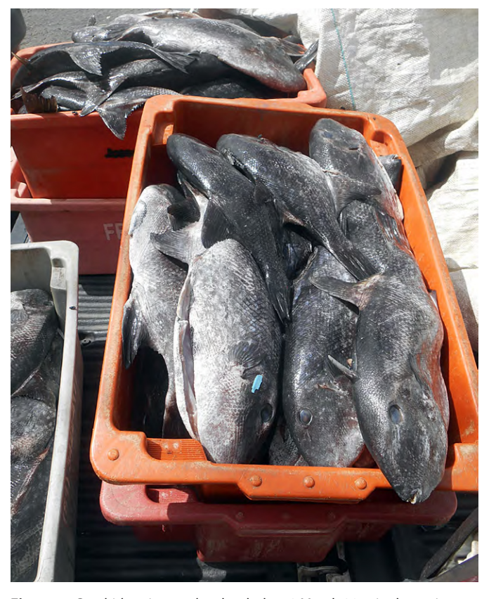
Figure 4. Canthidermis maculata landed on 2 March 2017 in the main port of Rio Grande do Norte state. The photo shows roughly 100 individuals. Total landings recorded in this date reached 600 kg of the species.

Nonetheless, there is increasing demand and global exploitation of Rough Triggerfish for human consumption, export, and for aquarium purposes (Sahayaki et al. 2014). Consequently, this species has economic and social importance for communities around the Indian, Atlantic, and Pacific oceans, enhancing