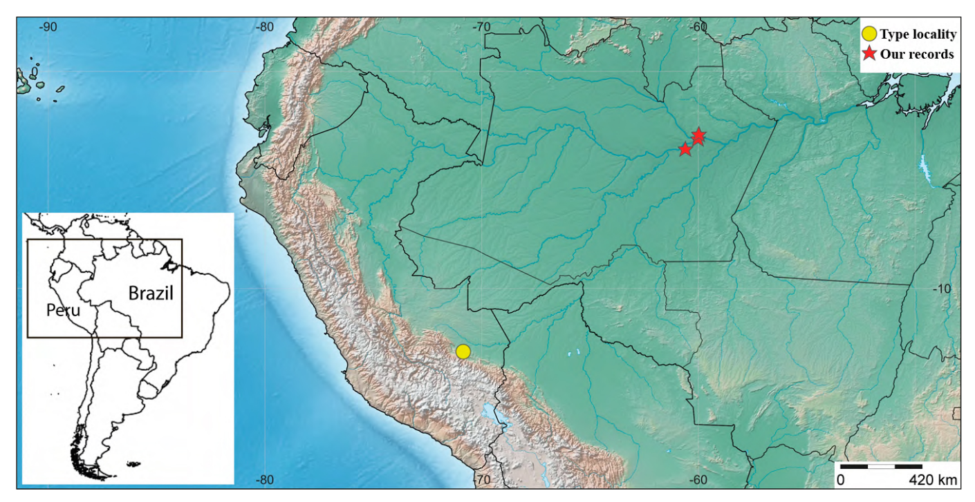
Figure 6. Distribution map of Clistopyga melanoptera Castillo, Sääksjärvi & Bordera, 2016 in South America.

C. melanoptera is extended to Manaus, 1700 km from the species' type locality.