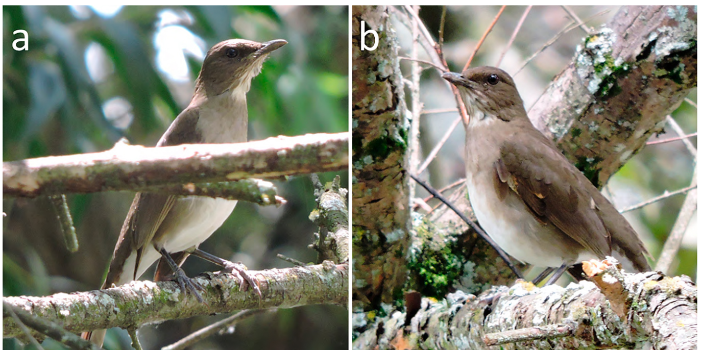
Figure 2. Photographs of Black-billed Thrush taken north of the city of Loja: (a) detail of the head, beak, throat and belly, (b) left flank.