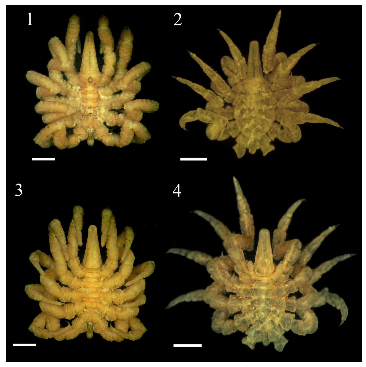
Figures 1–4. Pentapycnon geavi collected in Ceará, Brazil. 1. Dorsal view of the female. 2. Dorsal view of the male. 3. Ventral view of the female. 4. Ventral view of the male. LIMCE-UFC 904. Scale bar: 1 mm.

brownish cream in colour, trunk compact, fully segmented, with small granules in the cuticle and four strong tubercle dorsomedian placed directly posterior to ocular process (tubercle); proboscis conical, distally tapering; lateral processes or (crurigers) short touching at bases, or slightly apart almost touching, and its distal region has a margin with small tubercles; five pairs of legs, moderately short and robust; propodus with small single terminal claw and strong; ocular tubercle circular in dorsal view placed at middle region of cephalic, higher than other dorsomedian tubercles, four equidistant small eyes, darkly pigmented; abdomen horizontal, jointed from underneath the fifth segment; ovigers relatively small and short 7-segmented,