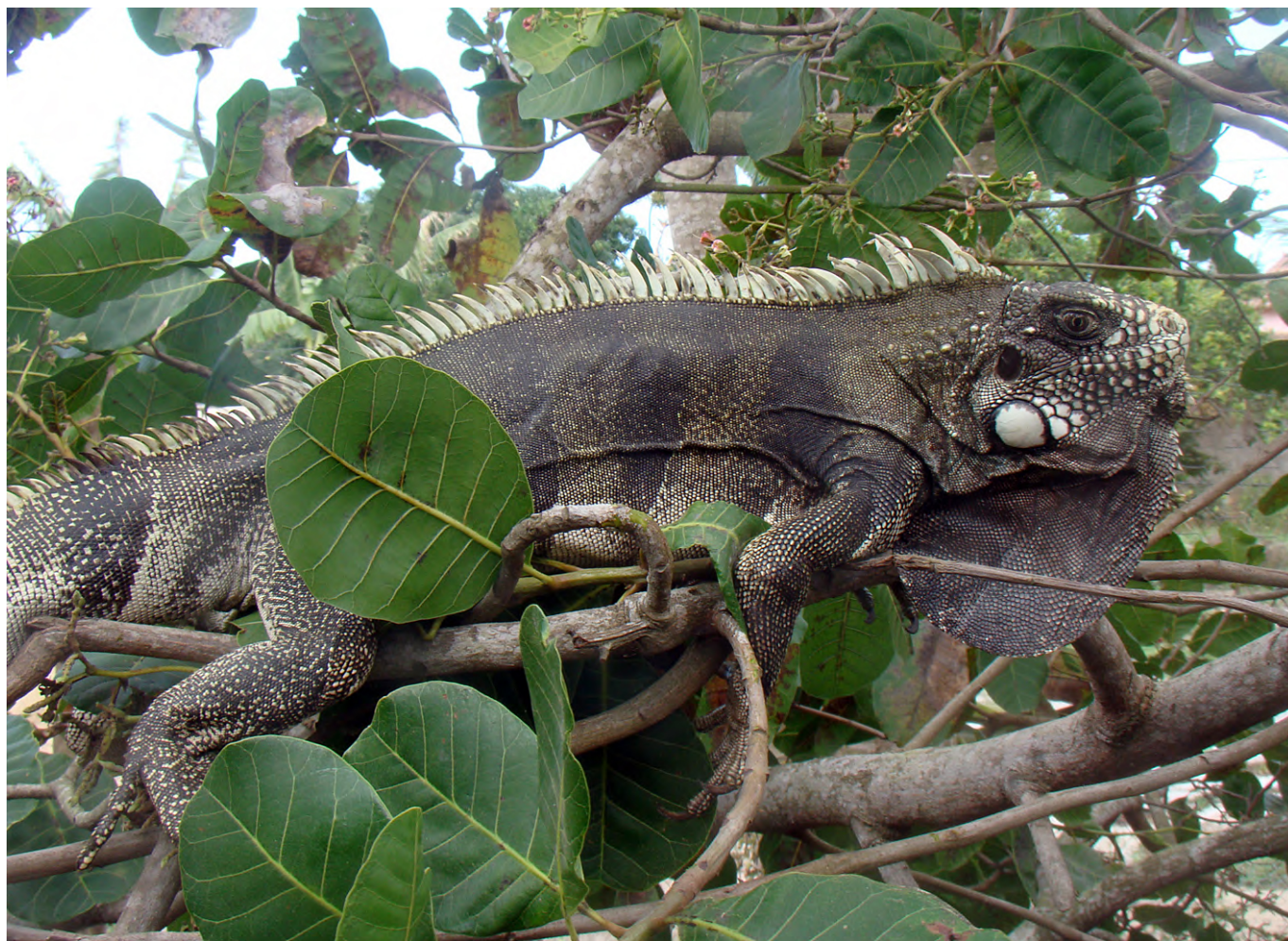
Figure 2. Adult male Iguana iguana from Municipality of Vila Velha, Espírito Santo, Brazil.

which indicates that the study period did not coincide with the species' recruitment season (e.g., ZUG & RAND 1987; ÁVILA-PIRES 1995; LÓPEZ-TORRES et al. 2012). All the individuals (adult and subadult) were observed in the upper strata of the vegetation, between eight and 23 m above the ground (Table 1), which is typical of the species (ÁVILA-PIRES 1995). The observation of both adults and subadults at the study site indicates that the population is well established. Local residents report the presence of adult and immature iguanas in the forest since 2006.