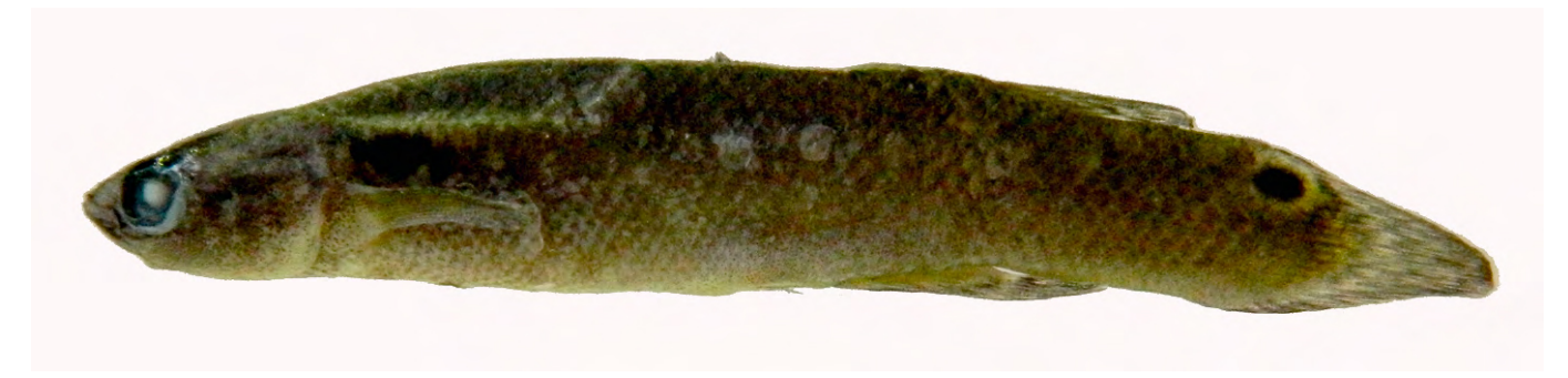
Figure 2. Kryptolebias hermaphoditus, 34.2 mm SL (catalog number: GEA.ICT 02458) from Ajuruteua beach, Pará state, northern Brazil.

The specimen (Figure 2) was captured in a shallow running stream of clear water with a salinity of 38 and located in the intertidal zone at Ajuruteau beach, which forms during the low tide (Figure 3). The stream was surrounded by Laguncularia racemosa vegetation. The time capture was approximately at 16:00 h, 12 December 2014, in the end of the full moon cycle. Poecilia vivipara Bloch & Schneider, 1801, Bathygobius soporator (Valenciennes, 1837), Micro gobius meeki (Evermann & Marsh, 1899), Mugil sp., and Eleotris pisonis (Gmelin, 1789) were also collected from the samestream as K. hermaphroditus .