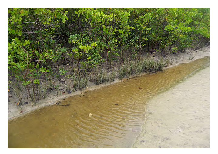
Figure 3. Habitat of Kryptolebias hermaphroditus at Ajuruteua beach, Brazil.

Due to the overall similarity among the species of mangrove killifishes, the identification of the specimen was confirmed with molecular data. The total genomic DNA was isolated using the protocol proposed by DNA Kit Wizard Genomic Purification (Promega Corporation, Madison, Wisconsin, USA). A polymerase chain reaction (PCR) was conducted to obtain 450 bp of the mitochondrial gene 16S of the new recorded specimen (Genbank acession number KU987428) using primers from Palumbi (1996): forward