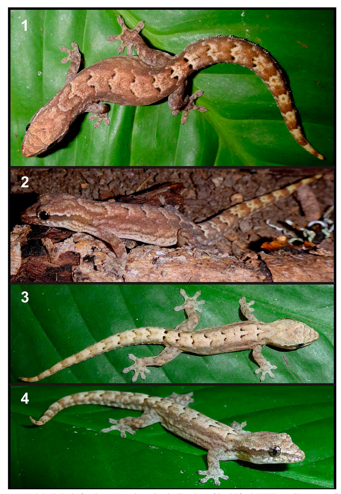
Figures 1–4. Lepidodactylus lugubris from Caracas, Venezuela. 1, 2. Dorsal and lateral view of the adult female MHNLS 22556 (SVL 39.6 mm), collected on 29 August 2016. 3, 4. Dorsal and lateral view of the juvenile MHNLS 22557 (SVL 27.1 mm), collected on 23 October 2016.