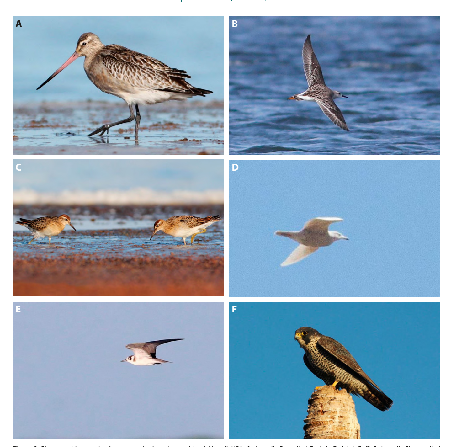
Figure 2. Photographic records of some species from Laysan Island, Hawaii, USA. A. Juvenile Bar-tailed Godwit. B. Adult Ruff. C. Juvenile Sharp-tailed Sandpipers. D. First-cycle Glaucous Gull. E. First-cycle Black Tern. F. Probable first-cycle japonensis Peregrine Falcon, in nearly adult-like body plumage aspect.

only six Circus sp. records in the Northwestern Hawaiian Islands through 2009, harriers have shown up more regularly on the main Hawaiian Islands (PYLE & PYLE 2009). Despite C. cyaneus being a distinct possibility—perhaps even expected—for the Northwestern Hawaiian Islands, only one Hawaiian specimen has been critically identified to C. hudsonius ; although, most other individuals showed characters consistent with that taxon (PYLE & PYLE 2009). All other Hawaii records have lacked sufficient detail for this difficult identification (PYLE & PYLE 2009).