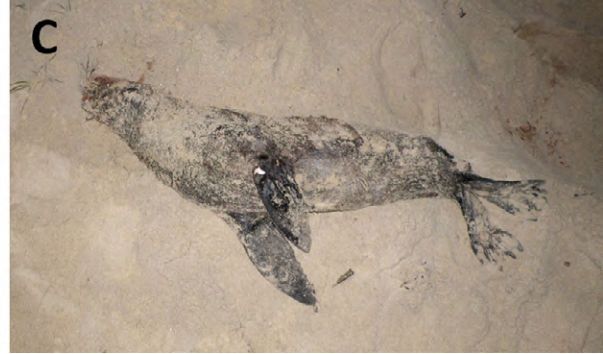
Figure 2. Records of pinnipeds in Espírito Santo state, Brazil. A. Mirounga leonina adult male (Table 1, record J). B. Arctocephalus tropicalis adult (Table 1, record M). C. Arctocephalus australis beach-cast carcass (Table 1, record Q).

Therefore, it is possible that pinnipeds coming ashore on the northern coast are less likely to be sighted and reported on by the media.