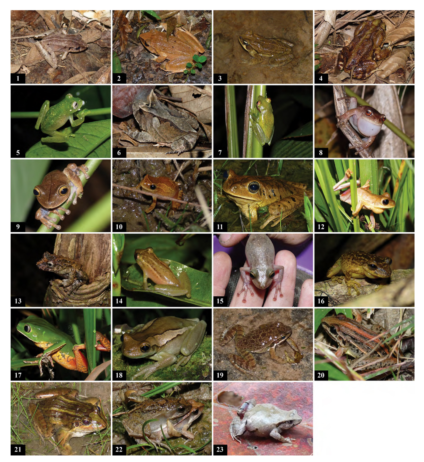
Figures 2. Amphibians recorded on the four sampling sites in Urussanga, SC, from November 2010 to December 2011: (1) Ischnocnema henselii , (2) Haddadus binotatus , (3) Rhinella abei , (4) Rhinella icterica , (5) Vitreorana uranoscopa , (6) Proceratophrys boiei , (7) Aplastodiscus ehrhardti , (8) Aplastodiscus cochranae , (9) Bokermannohyla hylax , (10) Dendropsophus minutus , (11) Hypsiboas faber , (12) Hypsiboas bischoffi , (13) Ololygon catharinae , (14) Scinax tymbamirim , (15) Scinax granulatus , (16) Scinax perereca , (17) Phyllomedusa distincta , (18) Trachycephalus mesophaeus , (19) Hylodes meridionalis , (20) Leptodactylus latrans , (22) Physalaemus cuvieri , and (23) Physalaemus nanus .

activity observed during the study indicated greater activity between October and January (Figure 1; Table 2). The period with the lowest number of vocalizing male species was in autumn (eight species), whereas the period with the highest number occurred in summer (18 species). Among inventoried species, Vitreorana uranoscopa vocalized only in