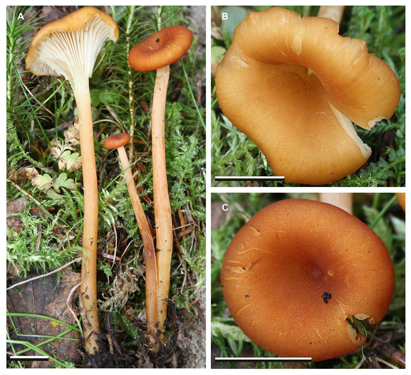
Figure 1. Appearance of Clitocybula lignicola (SVER 729000). A. Basidiomata. B and C. Pileus. Scale bars = 1 cm.

village (60°09' N, 038°33' E) and Kovarsino village (60°09'43.1" N, 038°35'49.1" E). The distance between these sites is about 2 km. Actually, both sites belong to the same unfragmented forest, and therefore, they are considered one locality. In Atleka Nature Reserve, specimens were collected from three sites (61°29'08.8" N, 037°41'44.7" E; 61°29'06.7" N, 037°41'55.1" E and 61°29' N, 037°41' E). The distances between sites are not greater than 100–200 m.