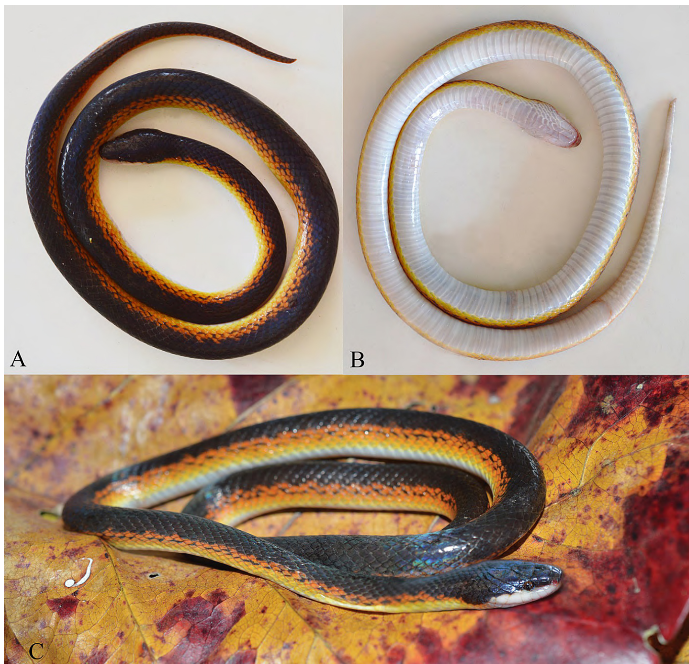
Figure 1. Xenopholis werdingorum (CIRA-299) collected during a herpetofaunal survey of the Reserva de la Biósfera Estación Biológica del Beni and surrounding area (Departamento del Beni, Provincia de Yacuma). A. Dorsal view. B. Ventral view. C. Live specimen.