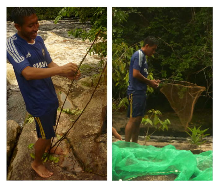
Figure 1. Art of artisan fishing "pisá".

deposited at the Colección Ictiológica de la Amazonia Colombiana-CIACOL of the SINCHI Institute, and cataloged with the number 849- CIACOL.