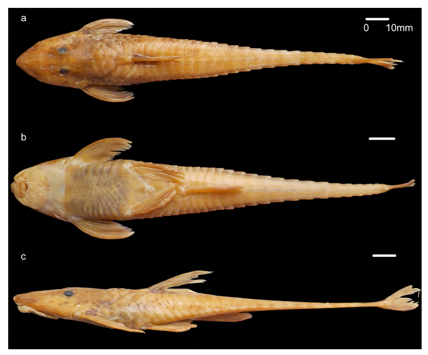
Figures 3. Rineloricaria daraha (849-CIACOL, larger specimen), a: Dorsal view, b: ventral view, c: lateral view.

explain, in part, why this type of system, which have been identified as ecotone (Torrente-Vilara et al. 2011) host endemic forms such as R. daraha. Rineloricaria daraha was only known from its type locality within the Rio Daraá, Brazil (Rapp Py-Daniel and Fichberg 2008). Here its distribution is expanded to include the Rio Negro basin, Colombia, which suggests that its distribution range could be over a wider area. Although it could be described as a rare species, waterfalls, where the species inhabits, are difficult aquatic systems to sample. Four species of Rineloricaria were collected at the Río Negro basin (in the main channel and its tributaries, Casiquiare, Baria and Siapa rivers) in Venezuela. These specimens were deposited at the fish collection of the MBUCV and do not match with R. daraha, which suggests that R. daraha may be endemic or restricted to some localities or habitats within the basin.