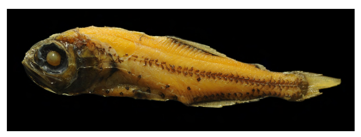
Figure 1. Electrona paucirastra Bolin, 1962. MZUSP 98865, 84.1 mm SL.