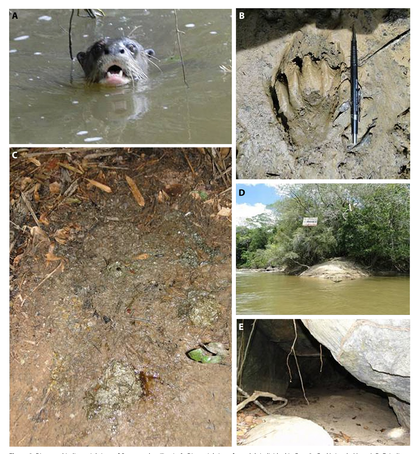
Figure 2 . Direct and indirect sightings of Pteronura brasiliensis . A. Direct sighting of an adult individual in Estação Ecológica de Maracá. B–E. Indirect sightings: ( B ) footprint (scale represented by 15 cm pen), ( C ) latrine, ( D ) camp, and ( E ) burrow.

75% of the total distribution of the Pteronura brasiliensis , there are still gaps in the knowledge of this species' distribution in Brazil (Evangelista and Tosi 2015), confirming the importance of this study. Although there is great difficulty in observing P. brasiliensis in the Brazilian Amazon, particularly owing to the complex logistics in this region, this work presented the first record of this species in the lavrado ecosystem, an ecosystem of diverse non-forest vegetation types and the largest contiguous