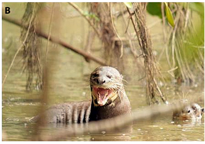
Figure 1. Pteronura brasiliensis in Estação Ecológica de Maracá (ESEC Maracá, Roraima) displaying alarm and territorial behavior. A. Two individuals exposing their heads and necks. B. One individual making repetitive noise.