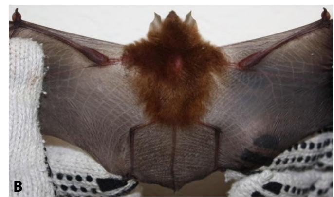
Figure 1. Female of Thyroptera discifera (CMUFS 0079) collected at the Refúgio da Vida Silvestre Mata do Junco, Capela, Sergipe, northeastern Brazil. A. Ventral view. B. Dorsal view.

The specimen, a lactating female, was captured with a mist net (7 \times 3 \text{ m}) about 1.6 m above the ground on 18 May 2012 at 20:00 h (license number 2011.05.0108/00113-011 SEMARH/SE). After the capture, the skull of the specimen was removed and cleaned, while the body was preserved in 70% alcohol. The specimen was deposited at the Coleção de Mamíferos da Universidade Federal de Sergipe (CMUFS 0079).