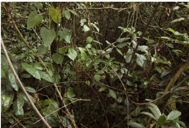
Figure 3. Habitat where Formicarius rufifrons was recorded on 27 February 2016.

Formicarius . The song of F. colma is a more acute and rapid trill, with a shorter interval between notes than the sequence of notes of the song of F. rufifrons . The song of F. analis consists of a single note followed by a rapid sequence of about 10 notes.