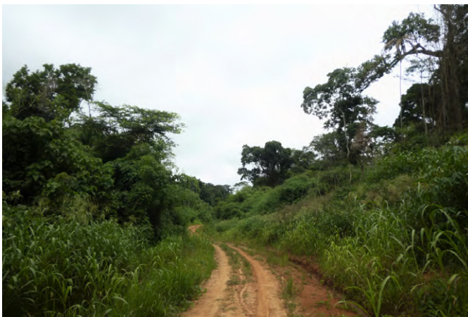
Figure 2. General view of the Riozinho do Rola road, Rio Branco, Acre State.