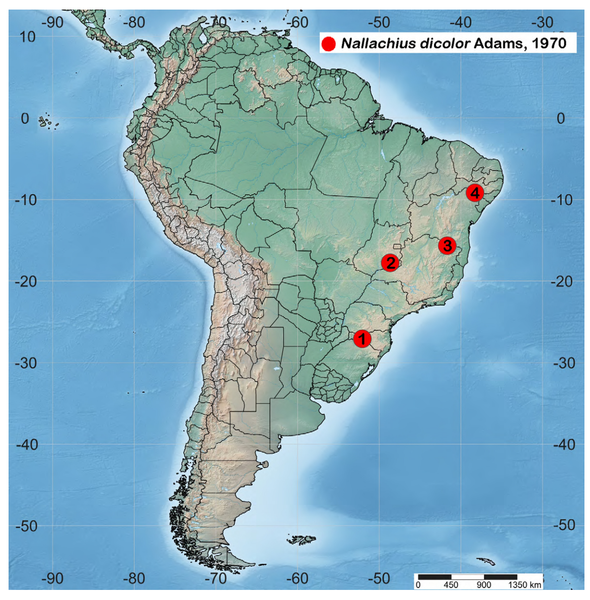
Figure 9 . Geographic distribution of Nallachius dicolor Adams, 1970 (Neuroptera: Dilaridae). Nova Teutônia, state of Santa Catarina (1); Caldas Novas, state of Goiás (2); Berizal, state of Minas Gerais (3); Jatobá, state of Pernambuco (4).

using the Auto-Montage Pro v5.02.0096 software, with further editing using Adobe Photoshop CS4.