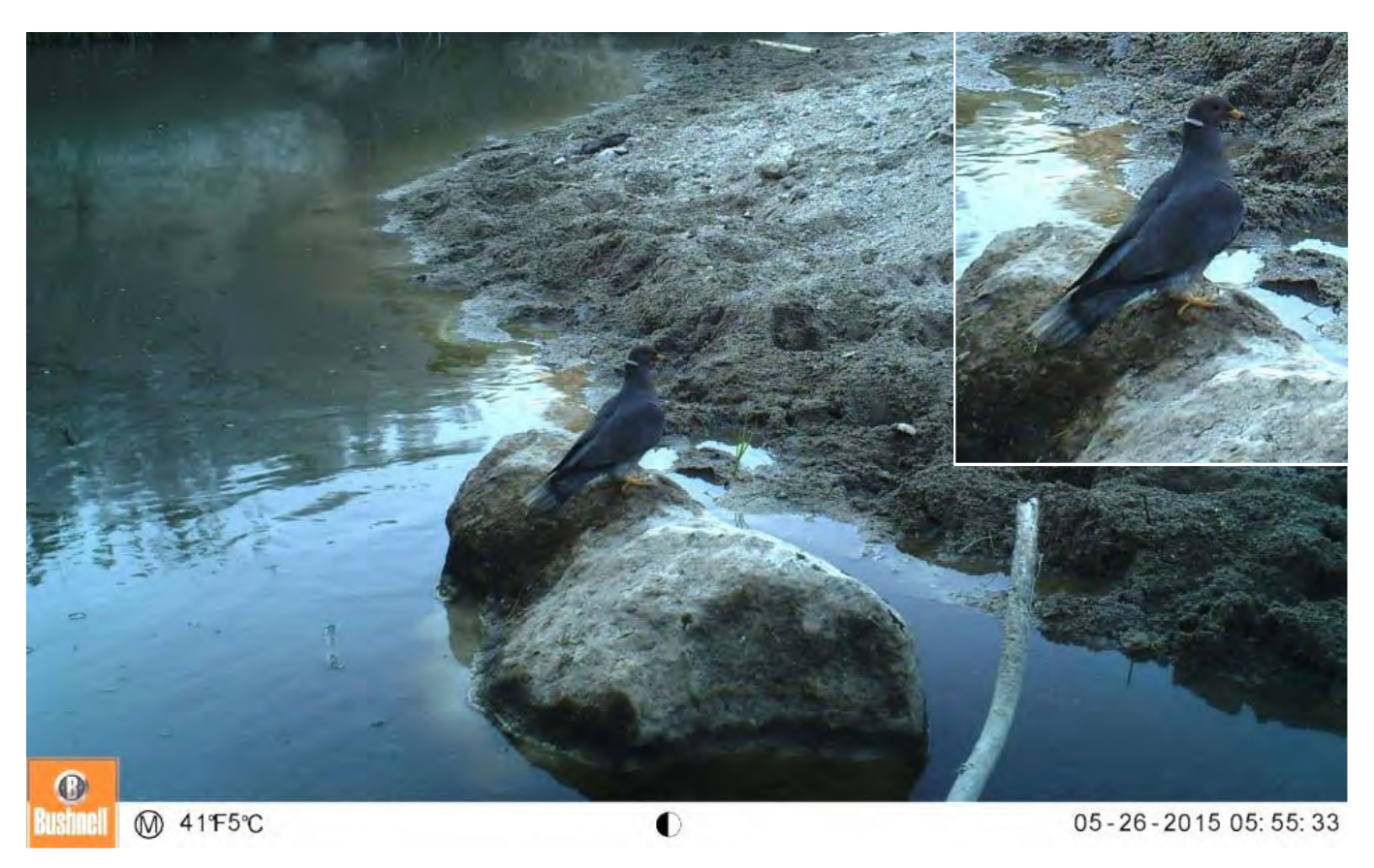
Figure 1. Patagioenas fasciata at the photograph site. Enlargement of pigeon in upper right corner insert. The site is 16 km north of Cataviña, state of Baja California, Mexico.