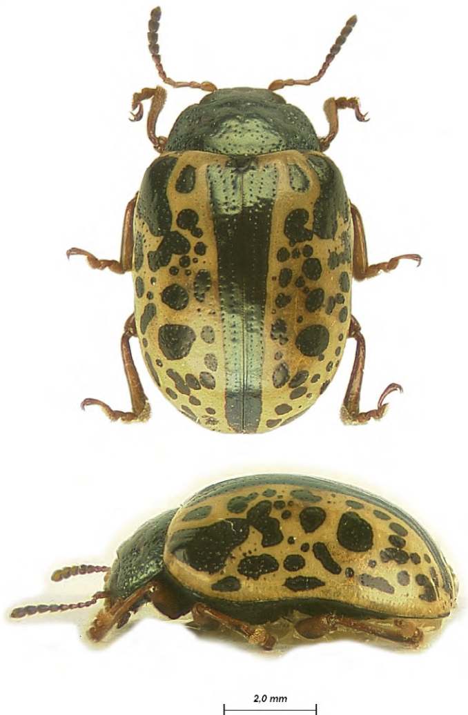
Figures 2 and 3. Calligrapha pantherina . 2: Dorsal habitus. 3: Lateral view (S. Cazères).

Koumac (Paagoumène), Tiébaghi (Société Le Nickel bureau, Creek-à-Paul Region), alt. 15 m, 20.485857, 164.193886, leg. H. Jourdan,