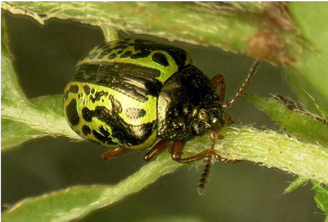
Figure 1. Living specimen of Calligrapha pantherina on its host plant.

from Fiji (Bule 2009). In Vanuatu, it was first released on Efate Island, but released and found in 2006 on Espiritu Santo (Jolivet et al. 2010a) and Mallicolo Island, and later on most of the archipelago.