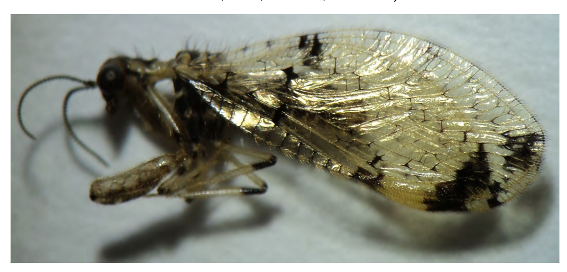
Figure 2. Plega zikani collected in the Mata do Baú, Barroso, Minas Gerais, Brazil.

second record of P. zikani , which previously was known only by three specimens collected from the Serra do Caraça, Santa Barbara municipality (Penny and Costa 1983). These two new records increase the geographical distribution of these two rare species of mantidflies, highlighting the importance of preserving natural forest fragments such as this.