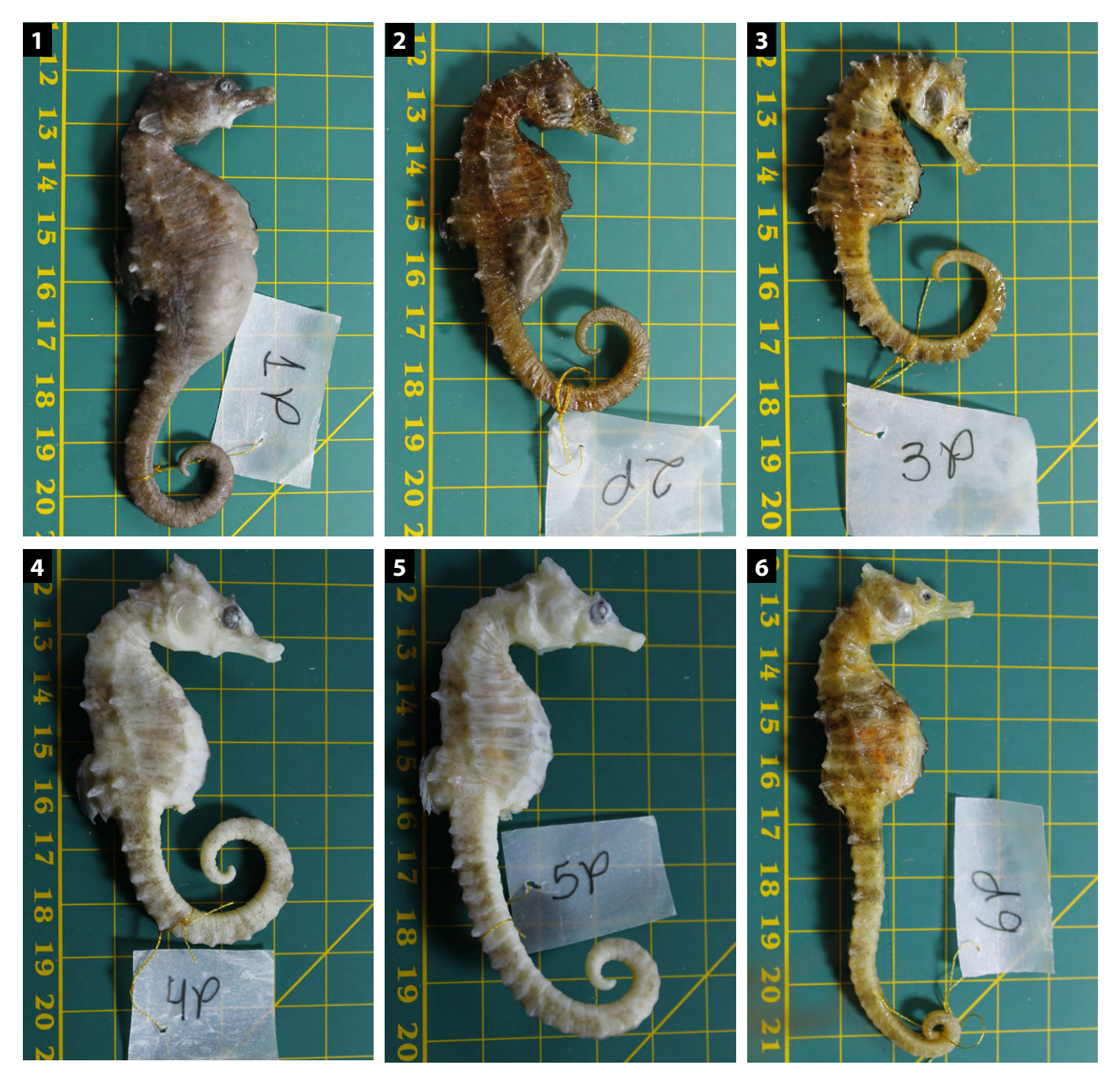
Figure 2. Individuals of Hippocampus patagonicus (MHNCI 12651) registered as bycatch in the shrimp trawl fishery in the coast of Paraná, southern Brazil. Recently fixed specimens (2, 3 and 6).

other species of the genus Hippocampus . All specimens closely resemble the description of H. patagonicus provided by Piacentino and Luzzatto (2004), González et al. (2014) and Silveira et al. (2014) (Figure 2), and counts and measurements were consistent with those reported by these authors (Table 2). Most of the characters provided by Piacentino and Luzzatto (2004) in the original description agree with those from the material examined. However, some differences in the following characters were observed (original description versus material examined herein): number of pectoral fin rays (12–14 versus 12–15), height range (21–103 versus 97–123 mm), proportion of snout/head length (2.43-3.47 versus 2.81–3.91), number of tail rings (37–41 versus 35–38),