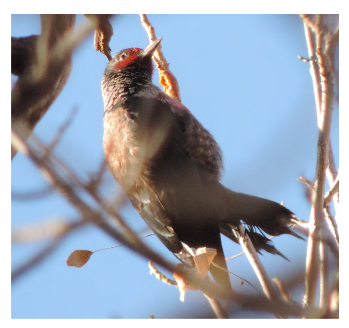
Figure 2. Lewis's Woodpecker, Melanerpes lewis , photographed in "Foothills and Plains with grasslands, xerophytic scrub and conifer oak forests ecoregion" at La Regina, Buenavenura Municipality, Chihuahua, northern Mexico, on 12 December 2014.

individuals were seen at Arroyo Santa Barbara on 19 December 1999 (eBird 2015) and 20 March 2001 (Gómez de Silva 2001), and one more at Puerto Peñasco on 30 March 2002 (Gómez de Silva 2002), all records south of its usual range. Likewise, "vagrant birds" have been documented in Nuevo León: one was found at Chipingue Park, Monterrey, on 9 March 2003 and was present through the following week (Gómez de Silva 2003), and another one was recorded at 2800m elevation on Cerro Potosí, Nuevo León on 14 June 2003 (Gómez de Silva 2004). Howell and Webb (1995) mapped a single record (December 1981) in northern Coahuila (without specifying a location record). It is likely that the species is more common than the Mexican records indicate, given this woodpecker realizes latitudinal movements away from its usual range and typical habitat, particularly when food abundance and forage habitat is available during the winter (Winkler et al. 1995). Even though the species is not globally threatened (BirdLife International 2012), it may be mainly negatively affected by urban and agricultural development, firewood cutting and inappropriate livestock grazing (Winkler et al. 1995).